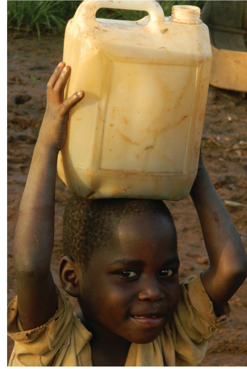
A child returns home with water fetched from Lake Wamala, Mamba village, Kyegonza Sub County, Gomba District.

Water is a social and economic good. When people don't have access to safe water it impacts on their health and their ability to engage in economically productive activities. When water supply facilities are not functioning it means there is idle capital. If functionality is low then the net effect of the service provided is reduced. This can result into a multiplicity of negative effects on citizens and on national development. Such is the significance of O&M and it must be prioritized by all actors, especially the Government of Uganda.