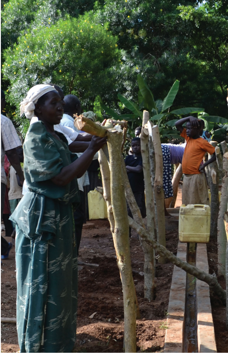
Residents of Kayinja Village, Kasodo Sub County, Pallisa district, erect a new fence around their borehole. The old fence was vandalised by people who want to use the poles for firewood.

According to the National Development Plan (NDP II) the government aims to attain universal access to safe water, by first of all ensuring that each village has at least one improved source. But it is also important to invest time, financial and human resources to ensure that the gains are not lost, when sources cease to function and are not rehabilitated. But then again, the kind of technologies required to construct facilities that can attain 100% functionality are quite expensive.