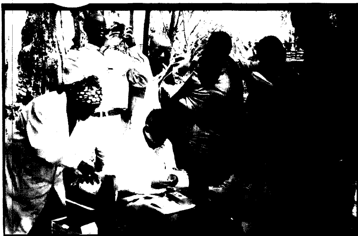
Picture 2. The investigator and technicians analyzing water quality