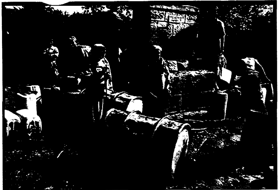
Picture 1. Poor handling of water storage

guideline value for E. coli . Compliancy was lower for water from household containers than for water from the corresponding sources. Water samples from 106 households showed post-source contamination of faecal origin. This may be attributed to poor sanitation and hygiene practices of the rural community.