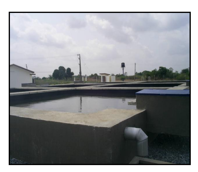
Figure 2.1: Treatment Plant