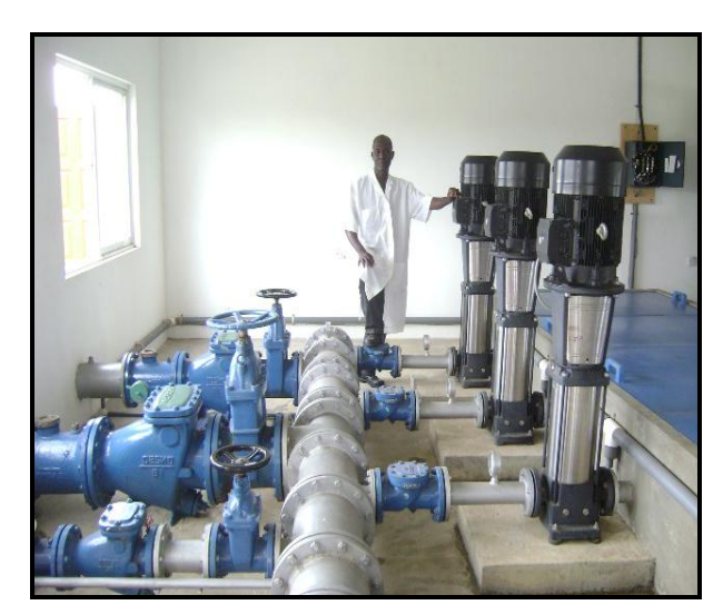
Figure 2.2: Pumping Station