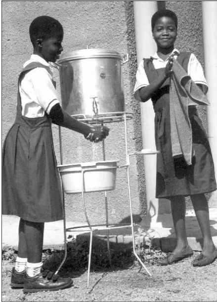
Hygiene education at school can improve habits in the rest of the community