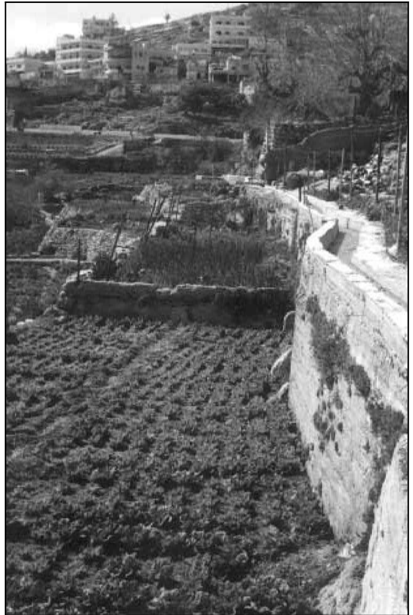
New irrigation channel on top of 8in sewage pipe passing village lettuce beds

PHG also invited water and sanitation engineering students from Palestinian and foreign universities to cooperate in the projects for their MSc thesis research on the applied technologies. It is too early to