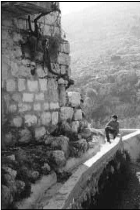
New irrigation channel on top of 8in sewage pipe passing the PHG project office in Artas

the village, that the support for the project quickly increased and households were willing to sign up for their contribution, i.e. the construction and/or financing of the sewers on private property between the houses.