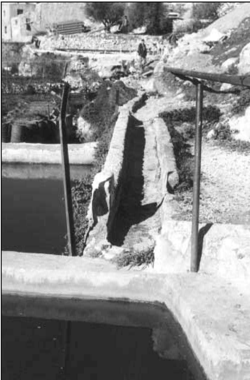
Old irrigation channel and storage ponds

Within the Sanitation and Environment Program of the Palestinian Hydrology Group (PHG), we are looking for ways to reduce costs in order to present an alternative that could be replicated in other villages as well.