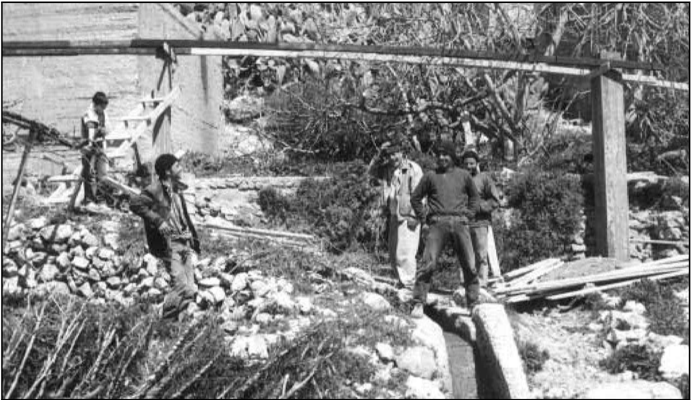
Construction of bridge for 10in gravity sewage line bypassing private land

still are, raised about the small diameter of the sewers. But our calculations show that in Palestine the costs of a small diameter sewer network appear to be around 40% of the costs of a conventional system. Even when the public sanitation works (collection, treatment and reuse) would only serve the village of Artas, it would cost $200 per capita. The cost for the neighbourhood sewer network will not exceed $500 per household. In comparison, the cost of construction of a regular cesspit (50 m 3 ) is between $1000-$1500, mainly due to high excavation costs.