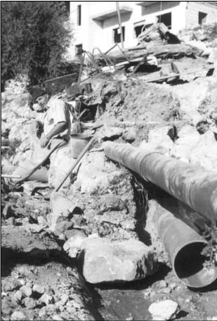
10in sewage pipe laid in old irrigation channel under steel irrigation pipe

difficult to forecast, and force project stakeholders to be flexible in their approach.