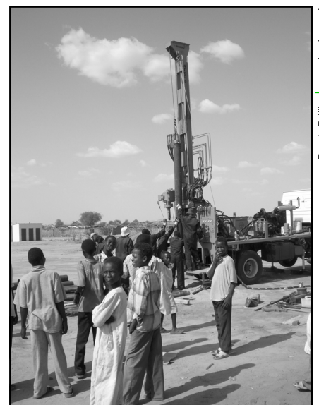
Private sector drilling companies have only recently emerged in Ethiopia

As elsewhere, federal government's role has evolved from that of service provider to setting sector policy and strategies, channelling funding and providing guidance to the regions, and regulating the private sector and other