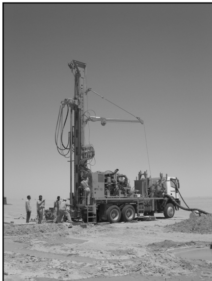
Large distances between drilling sites add to costs

providers of goods and services. The Regional Water Resources Bureaux (RWBs) in turn are the major purchasers of contracted-out services, such as borehole drilling, using donor and nationally generated funds. Where Ethiopia differs from many other African countries is in the supply side of the equation. Box 1 summarizes some of the main features of the drilling sector, with a focus on the main groups of players.