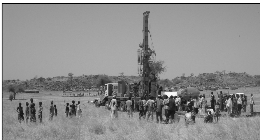
Drilling draws a crowd in Kadogly, Sudan