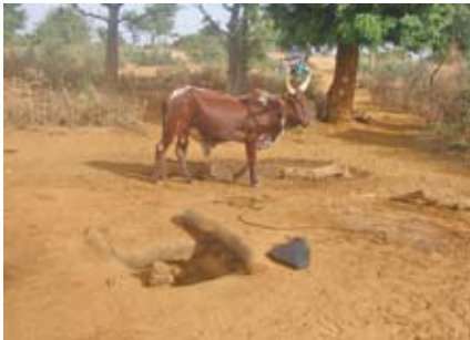
Traditional hand dug well lined with wood

Development projects have introduced 'modern' wells, which are lined with concrete rings, or bricks with mortar, to improve safety and water quality. The Niger Government estimates that in addition to the countless traditional wells, the rural population (78 percent of the total population 1 ) is served with modern sources comprising some 13,000 cement-lined wells, 7,000 machine-drilled boreholes fitted with hand pumps, and many small-scale piped supplies 2 . Government assumes that the modern sources supply 250 users each.