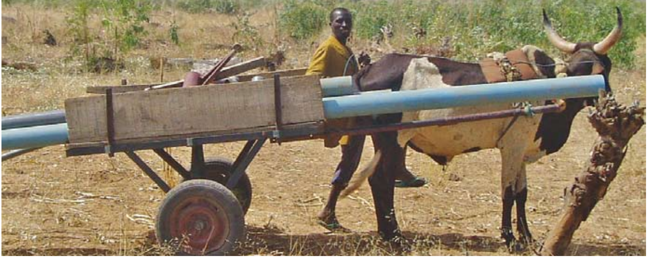
Transporting hand-auger equipment by ox cart