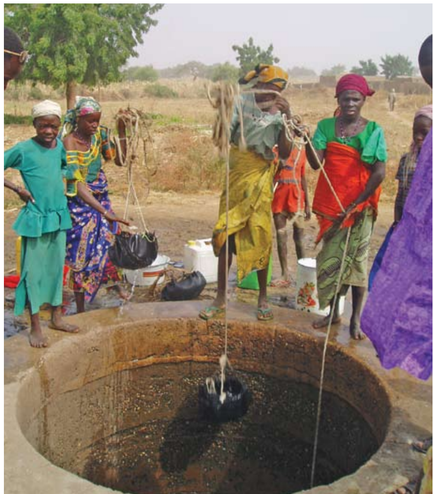
Fetching water from a cement-walled well

Finally, water quality and water resource concerns need to be carefully researched, taking into account the fact that people often use the same water supply for both drinking and farming. The potential for contamination of shallow groundwater from excreta disposal, fertilizers and pesticides, needs to be thoroughly examined. If more motorized pumps are used, the danger of over-exploitation and depletion of shallow groundwater resources should be investigated.