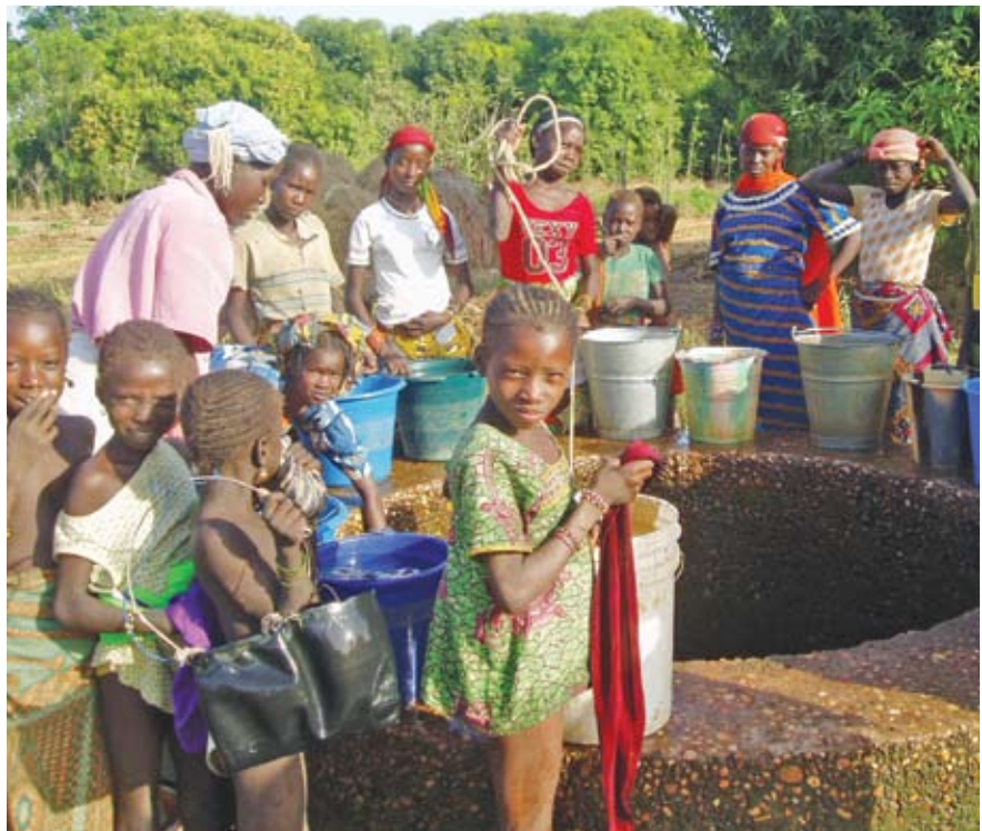
Fetching water at a cement-lined well

Exploitation of groundwater through hand-drilled wells involves four stages: drilling, well lining, well development and installation of a water-lifting device.