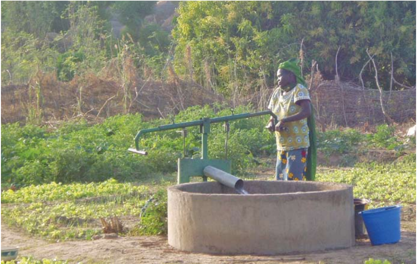
Woman uses hand-operated treadle pump in Karra

This Project enabled hand augering to take root in parts of the Madaoua region. The director of Projet de l'Irrigation Privée II in Maradi reports: "When I arrived in November 1991 there were 91 [hand] drilled wells in Madaoua and Bouza Districts [both in the Tarka Valley]...by December 1997 there were over 2,600 drilled wells." These were drilled for farmers by local enterprises.