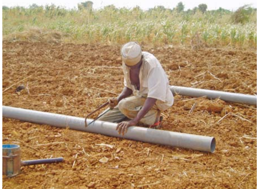
Cutting well screen on site

Very little systematic work has been undertaken to verify or substantiate water quality concerns. Many shallow hand-dug wells are considered by Government to be 'modern' water points. Hand-dug wells may provide