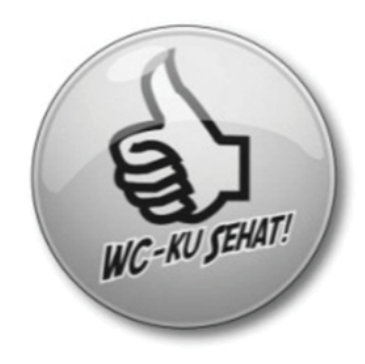
Figure 2. Safe toilet logo.

Accredited providers are authorized and encouraged to use the logo "WC-Ku Sehat" through the Global Scaling Up Sanitation Project to signify "safe toilets".