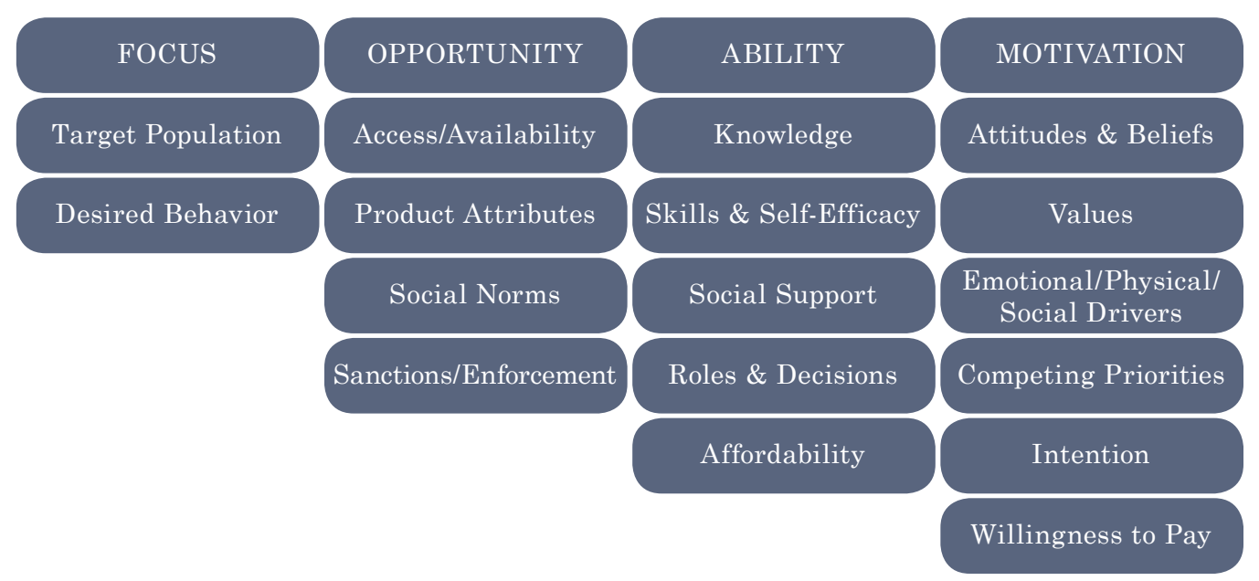
Figure 1. SaniFOAM behavior change framework.

The Global Scaling Up Sanitation Project has focused largely on the first two behaviors in light of its main goal of improving access to safe sanitation. In early 2008, WSP convened a workshop in Durban, South Africa, aimed at developing a framework to help understand and explain sanitation behaviors so that program managers can design more effective programs. Approximately 30 participants from seven organizations attended the event, sharing their research findings and other data to help build the conceptual model.<sup>4</sup> The outcome is a simple, explanatory framework called SaniFOAM<sup>5</sup> (see Figure 1) that identifies the key factors or determinants that influence sanitation behaviors.<sup>6</sup>