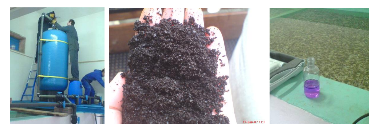
Figure 5. Installation of the reactive filter using iron oxide adsorbent medium.

The combination of filtered and unfiltered flows (25 m ^3 × h ^{-1} ) allowed for a final water arsenic concentration below 8 ppb, as depicted in Figure 6.