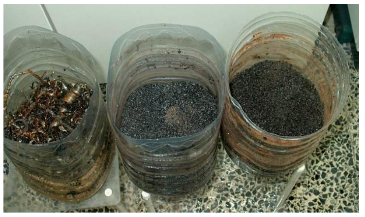
Figure 4. Laboratory experimental trials for the selection of the most effective and viable methods.

The pre-selected techniques were based on a scheme consisting of oxidation using chlorine dioxide followed by coagulation with aluminium sulphate and sand filtration. The results of the first set of experimental trials (Figure 4) produced removal efficiencies above 37% for raw water exhibiting an initial concentration of 10 ppb. These removal efficiencies were independent of the coagulant dosage in the experiments.