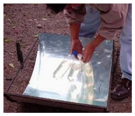
Figure 2. Arsenic removal using the SORAS process.

The SORAS ( Solar Oxidation and Removal of Arsenic ) process has been used in the rural Andes regions in Latin America. It is based on the adsorption of As(V) onto iron oxides and hydroxides using UV radiation [33-35] and the addition of citrate as a catalyst for the formation of oxidising radicals that allow the conversion of arsenite to arsenate (Figure 2).