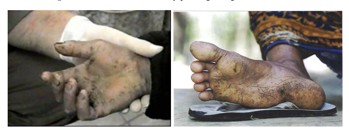
Figure 1. Skin lesions caused by prolonged ingestion of arsenic.

The conclusions of several epidemiological studies confirmed the potentially carcinogenic effect (skin, lung, bladder, kidney, liver, uterus and gallbladder) of a few inorganic species of arsenic when present in high concentrations. This led the WHO to recommend in 1993 a more restrictive guidance value of 10 ppb as the quality standard for drinking water, a value that is five times lower that the previous recommended limit. This drastic reduction in the maximum arsenic limit issued by the WHO has an essentially preventive character, since that parametric value is not yet sufficiently supported by extensive and conclusive epidemiological studies that are urgently warranted. Later on, in 2003, the United States Environmental Protection Agency (USEPA) drafted a proposal issuing final guidelines for cancer risk assessment [11]. The revised document advocates the use of nonlinear relationship between arsenic carcinogenesis and its dose in drinking water.