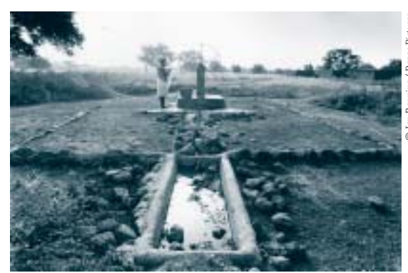
Dedougou, Burkina Faso. Water well built with foreign aid.

The ECs development co-operation has found it helpful in most regions to regroup different kinds of activities, in which water is central or in which water-related investments are important, into four 'Focus Areas'. These address functions rather than technical aspects in isolation: one cross-cutting focus area called " Water resources assessment and planning " (WARP) and three specific societal functions, namely " Basic water supply and sanitation services " (BWSS), particularly in rural and marginal urban areas, " Municipal water and wastewater services " (MWWS), addressing major urban installations and their management, and " Agricultural water use and management " (AWUM).