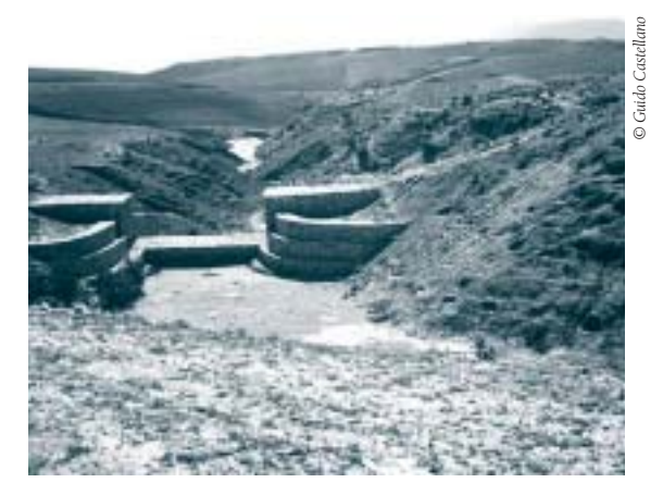
Example of a small dam aiming at reduction of erosion by flash floods, Tunisia.

Receding lake waters left behind ghost towns from what were once fishing communities (commercial fishing ceased in 1982), a saline dust bowl, health problems and uncounted social distress for the 5 million people living in the region around the lake. Numerous research collaborations have analysed the context and continue to provide knowledge for remedial action. Selected projects address some key aspects: "Desertification in the Aral Sea region: A study of the natural and anthropogenic Impacts" (ARAL-KUM)<sup>48</sup>. "Crop irrigation management for combating irrigation induced desertification in the Aral Sea basin" (CIRMAN-ARAL)<sup>49</sup>, focuses on developing strategies for water saving through improved irrigation scheduling and field practices, thus reducing water demand for agriculture, improving control of drainage water and soil and water salinity. "Prevention of land degradation in the Aral Sea region undergoing disastrous desertification by increasing tolerance of symbiotic nitrogen fixation