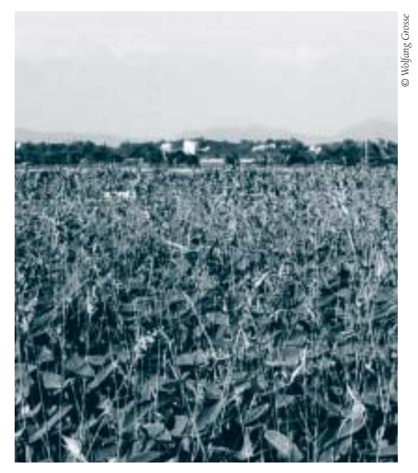
Shenzen integrated wetlands are an example for other Chinese cities.

The peri-urban interface, with its often dynamic development of food, energy demand and production, habitat restoration and vibrant socio-economic structures, has attracted increasing research and policy attention, but is still poorly understood. "Women, well-being, work, waste and sanitation: Action research on alternative strategies of environmental sanitation and waste management for improved health and socio-economic development in peri-urban coastal communities in South Asia" (4WS) and "Sustainable farming at the rural-urban interface – An integrated knowledge-based approach for nutrient and water-recycling in small-scale farming systems in peri-urban areas of China and Vietnam" (RURBIFARM)<sup>39</sup> are just two on-going research test beds responding to some of the above-mentioned challenges. When successful, such research precedes investment.