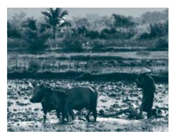
ACP countries, Asia, Latin America (developing countries), the Mediterranean, Russia and the other New Independent States and Western Balkans. At the time of writing some 100 INCO projects<sup>16</sup> relating to water are on-going and another 186, mostly intra-European, projects are funded through the Key Action 'Sustainable Management and Quality of Water'<sup>17</sup> in FP5.

From 1994 on, the Commission's international scientific research activities have been given a uniform structure (INCO) as part of the Research Framework Programmes (FP4, 1994-1998, FP5, 1998-2002). INternational CO-operation covers