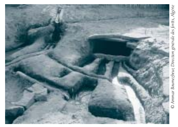
The 'Kasria' of the Ouled Said Oasis in Adrar, Algeria, serves to distribute the waters of the ancient foggara in an equitable way.

We can look at some outstanding achievements in harnessing water resources for food and socio-economic development in history and learn from these to help deal with today's challenges. Among the examples are the 'tanks', small reservoirs impounded by a dam across a seasonally flooded depression, which are still widespread in India and Sri Lanka. These date back to ancient times for enabling irrigated agriculture. An EC development project operating between 1984 and 1996 in Tamil Nadu with a budget of €65.8 million, involved lining the main irrigation and drainage canals and carrying out other essential maintenance work. During a later phase, much more