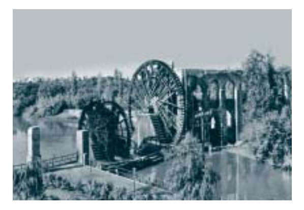
Noria in Hama, Syria, from postcard restored by Aly Abbara.

As early as the fourth millennium BC, the Sumerian civilisation achieved highly productive agriculture on the central Euphrates River floodplain in what is now a desolate region. The surplus generated by the sophisticated irrigation farming then enabled the formation of the first cities and socio-economic specialisation, as confirmed by currently available archaeological evidence. The irrigation required complex social organisation and supported a population growing ten-fold up to an estimated 1 million inhabitants. The Sumerians were also the first to develop a written language, the cuneiform script.