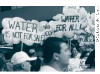
Water figured prominently at the World Social Forum in Porto Alegre, Brazil, in 2003.

tions and NGOs, and interact with public authorities, citizen groups, water utilities and other stakeholders. A series of workshops and participation in conferences, in addition to publications and the project's popular website allow for the wide circulation and debating of the research results and 'testing the waters' for adjusting policy and management.