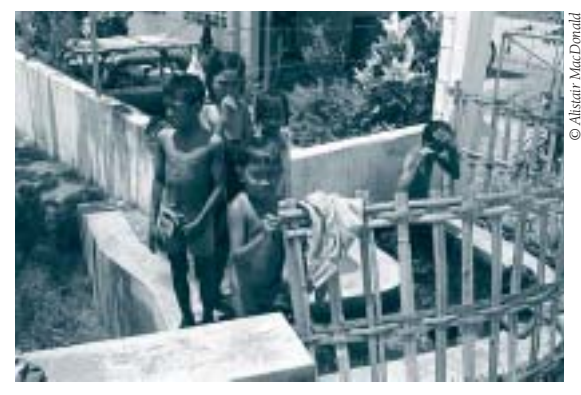
Children playing and washing in a canal, Indonesia.

"Development of cost-effective reclamation technologies for domestic wastewater and the appropriate agricultural use of the treated effluent under (semi-)arid climate conditions" (CORETECH)<sup>41</sup> is a research collaboration between three Southern Mediterranean and three European research teams signalling a major paradigm shift towards considering domestic wastewater as a resource. Treatment and re-use will address several concerns concomitantly, such as health risk, agricultural soil improvement. Treatment will be scaled to low-grade applications (in cotton production, trees and animal fodder) requiring only plain, low-cost techniques and reduced energy demand. It is just one example of a systems perspective adapted to local conditions in the Southern Mediterranean.