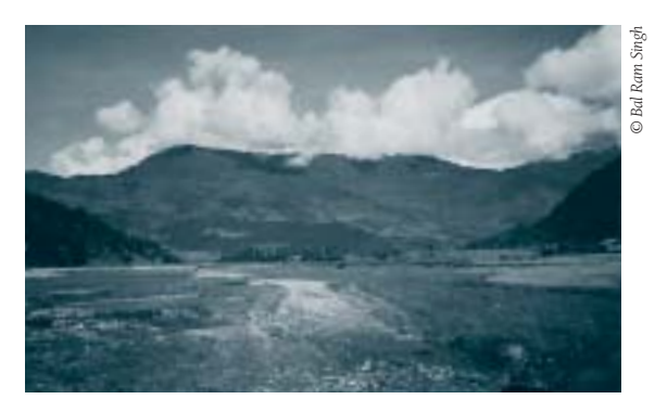
The view of Mardi watershed from the valley: forest, grazing land and cultivated lands are major land uses in the watershed.

Already a relatively modest rise of 1 to 2°C results in a shift of precipitation from snow to rain. In the past, at lower temperatures, much of the abundant winter precipitation would fall as snow, compact into ice in the glacier and then released gradually during the seasonal melting of the dry summer months. Now, a high percentage comes down as rain leading to much more frequent flash floods and longer dry period during the rest of the year. These patterns are observed in all major mountain ranges, from the Alps, the Andes, the Himalayas to the Rocky Mountains. The ice sheet in the Himalayas is the third biggest in the world, after the Antarctic and Greenland, and all of the