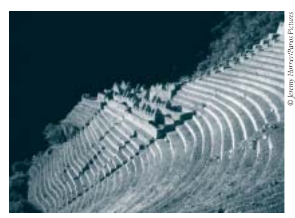
Cuzco Region, Peru. Winay Wayna Incan ruins.

The most sophisticated forms of water harvesting consist of groundwater tappings, including the famous qanats originating in Iran some 3 000 years ago. Qanats or kariz are tunnels dug into uphill aquifers conducting water by gravity to use in lowlands. The system spread to the Middle and Near East as far as Algeria ( foggara ), Morocco ( khottara ) and into Andalusia ( madjirat ), but is also known from China and sites in Mexico, Peru<sup>24</sup> and Northern Chile. These systems were enabled by strong community organisation and were sustainable because they could only withdraw as much as was replenished through