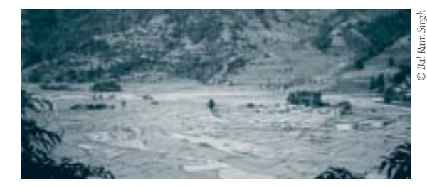
The view of irrigated rice terraces that are prevalent in the valley floor and in hill slopes.

Changes in land-use pattern, particularly deforestation in the upper regions, overgrazing and other interventions are increasingly recognised as additional, more local, drivers in increasing desertification and changing flood behaviour downstream. They compound the global change effects sketched above. An INCO research collaboration between three European and three Asian partners is currently working on "An interdisciplinary approach to analyse the dynamics of forest and soil degradation and to develop sustainable agro-ecological strategies for fragile Himalayan watersheds" (HIMALAYAN DEGRADATION)<sup>54</sup>.