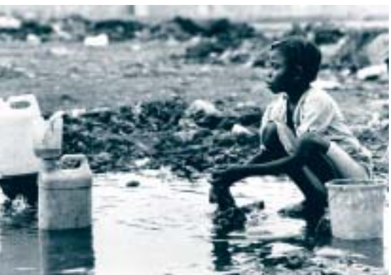
Haiti. Washing clothes.

Change of land use, deforestation of mountainous regions where springs of the principal river systems of the world are located, the melting of glaciers and changing patterns of rain and snowfall, are all modifying the run-off regimes of rivers in many parts of the globe. These and other trends are usually referred to in the context of 'global change'.