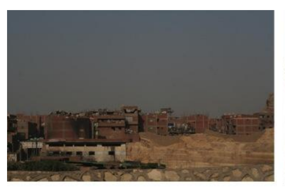
Figure 1. Zabaleen Garbage City.

The paper investigates recently launched privatization plans for local MSW management in Cairo, focusing on local attitudes towards its adverse effects on the sustainability of the recycling economy and urban settlement system of the garbage collectors communities [1,10]. According to the official development strategy, the privatization of MSW services is regarded as fundamental to wider government plans for the rehabilitation of Medieval Cairo. The objectives of the rehabilitation programme tend to favour tourist-orientated projects, whilst ignoring the local population's interests [11], through the proposed removal of informal 'Zabaleen' settlements on Muqattam mountain, and through the future evacuation of the nearby Eastern Cemetery's tomb dwellers and shanty town. buildings [12-14]. It could be argued that the privatization plan and eviction proposals are linked to the 1990s IMF Economic Reform and Structural Adjustment Program (ERSAP) which embraced the World bank's main economic strategies particularly free market enterprises, currency devaluation, privatization of state assets and public services, including waste management, reducing public spending and eradicating subsidies for low income consumers.