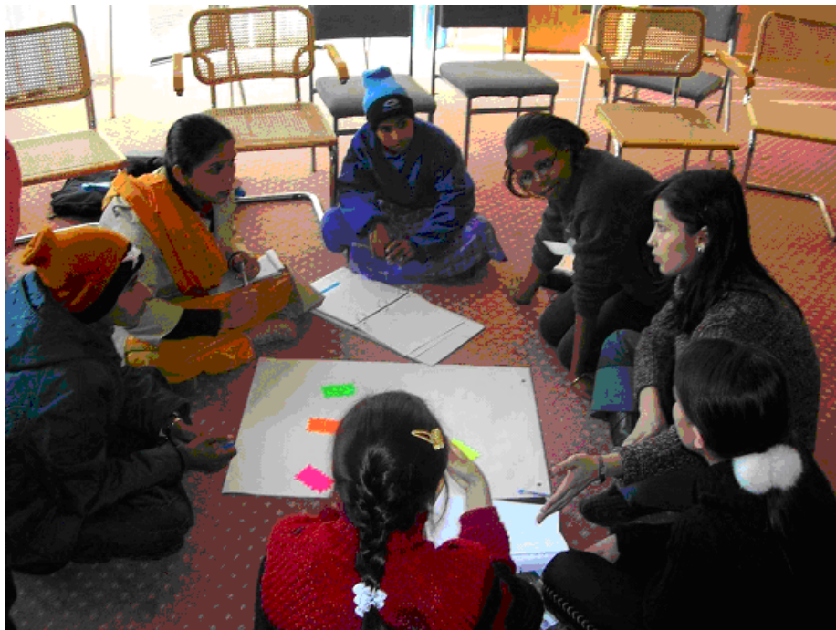
© Nina O'Farrell, 2005, Oxford, UK