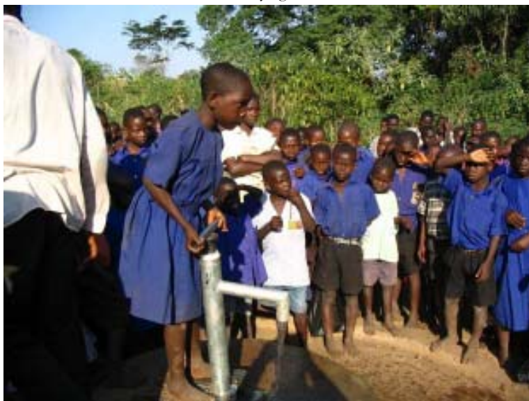
Photo courtesy of Ryan's Well Foundation: Karutu school district, United Republic of Tanzania

Three keynote speakers highlighted the need for dedication and commitment towards a minimum quality package for water, sanitation and hygiene education for schools. Each used a different entry point to reflect concern for the urgent need to create a template for action calling on the experience and expertise of all stakeholders to improve the quality of life for all children, and in so doing, to meet the MDG target for water and sanitation. Each speaker also conveyed an optimistic approach to the viability of meeting the target in an inclusive and collaborative way.