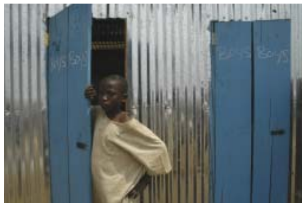
Liberia

The following pages are comprised of selections from the case studies that were prepared for the Roundtable by UNICEF Water, Environment and Sanitation programme officers working with government counterparts. Roundtable presentations by government officials and youth delegates are highlighted throughout.