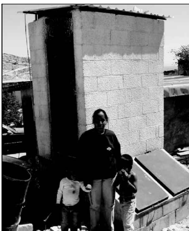
The double-vault biodegrading toilet has passive solar panels to raise the temperature