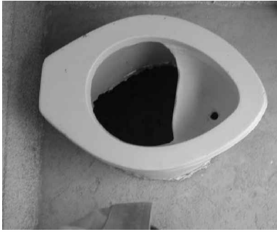
Top view of a urine-diverting pedestal. Moulds for casting were obtained from César Añorve, CITA (Centro de Innovación en Tecnología Alternativa, Cuernavaca, Mexico)

efficient biodegradation, which requires moisture levels of 40–60 per cent. 6,7 On the other hand, the dehydrating system had only 7 per cent moisture at four months (see Table 2), which is appropriate for a desiccating system. Thus, in terms of moisture content, the dehydrating system was performing better than the biodegrading system.