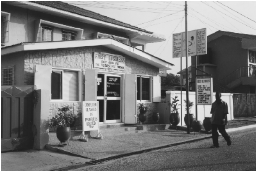
Accra, Ghana, 2004