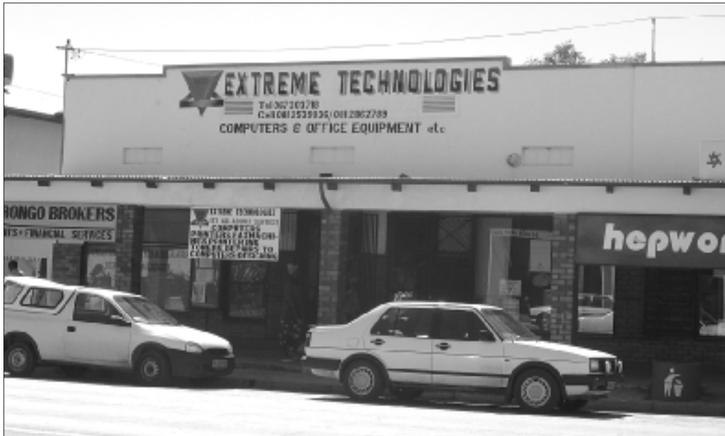
Otjiwarongo, Namibia, 2004