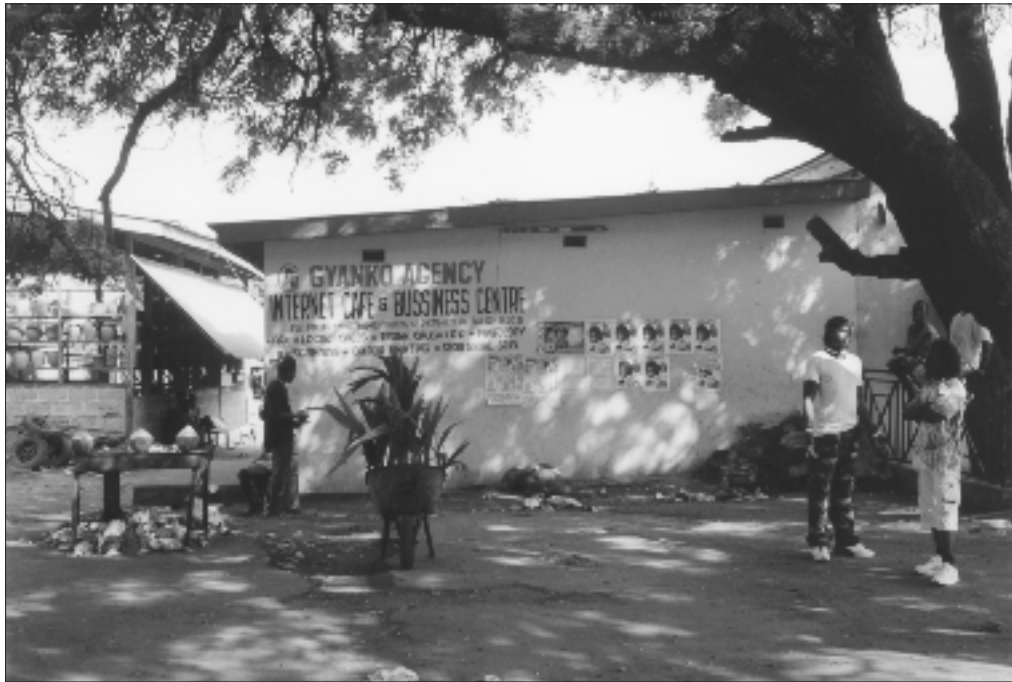
Accra, Ghana, 2004