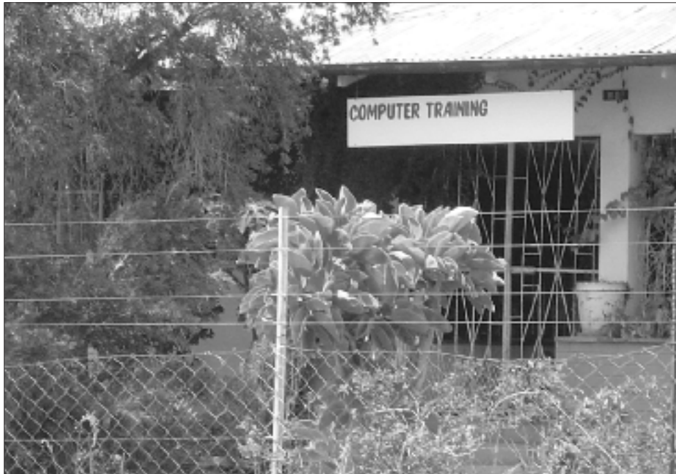
Okahandja, Namibia, 2004