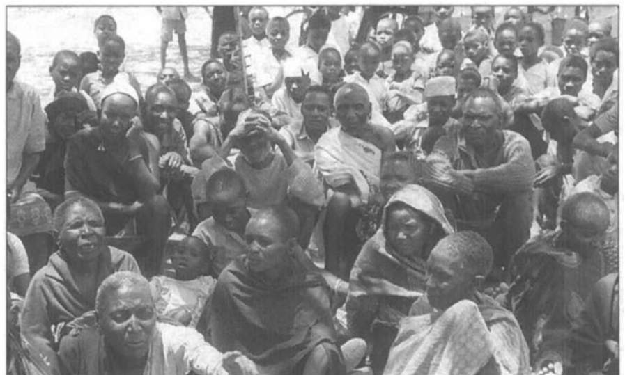
Tanzanians meet to discuss their water-supply needs. Officials' input and response to villagers' initiatives should be the norm, not the exception.

training workshops used in the villages have been developed jointly by the fieldworkers and their WaterAid