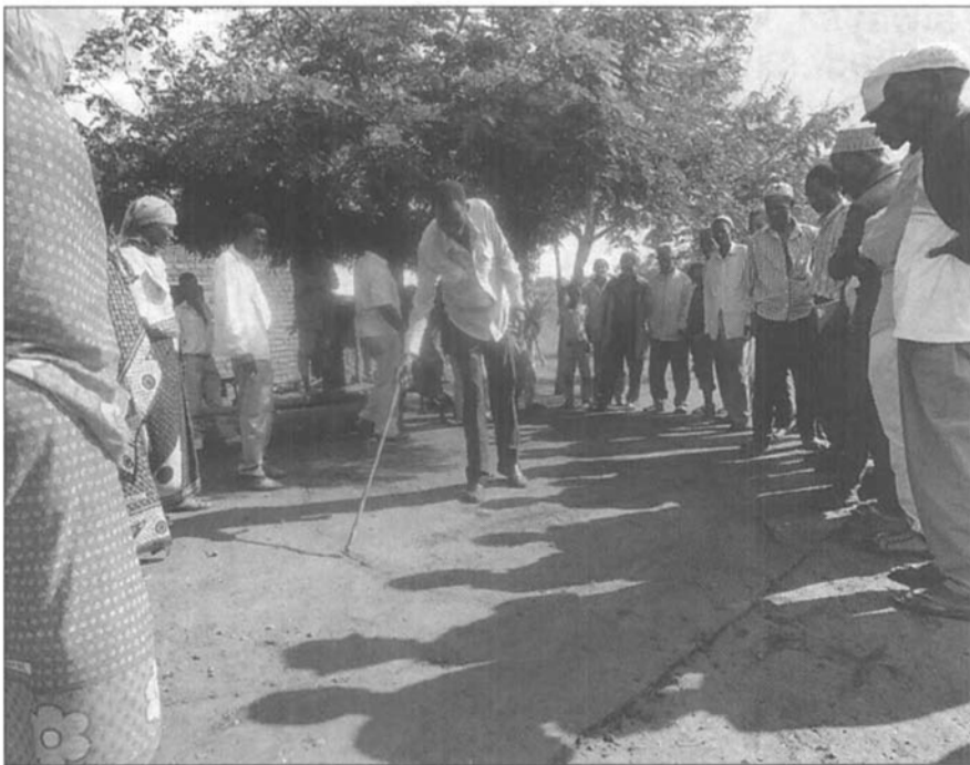
Programmes should develop organically — this PRA village mapping in Kikilo Kati was developed jointly by fieldworkers and their WaterAid colleagues.

Training has given the fieldworkers practical community-development