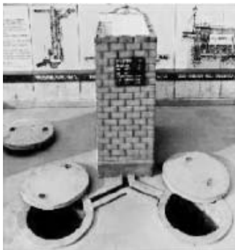
Fig. 1. Two-pit pour-flush toilet.