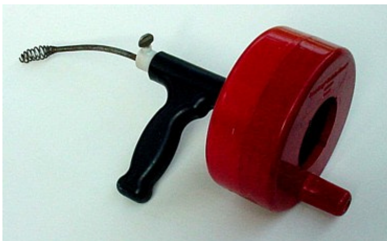
Fig. 2: Mechanical snake used for cleaning urine separating toilets