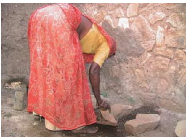
Manual scavenger in Gujarat

mentioned in the Rig Veda began to modify itself into the “caste system”. Manual scavenging evolved with the evolution of the “caste system”. The literature and religious books henceforth describe the presence of manual scavengers under condition/system of slavery. However, there is evidence of existence of wet toilets in the ancient times like at Harappa and Mohenjo-Daro (civilisation dating to 2,500 BC). These cities had toilets, which were connected to underground drainage system lined with burnt clay bricks.