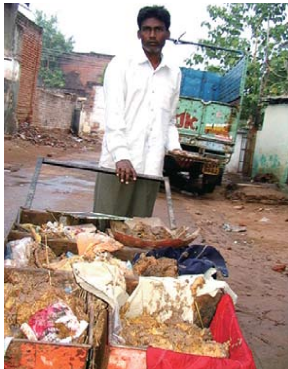
Mannal scavenger with a cart, Gujarat

Manual scavengers are appointed by the Panchayat or municipality in many states where they work as permanent employees and draw salary as per government salary norms. Temporary employees get the salary on daily wage basis. Gujarat, West Bengal and many states of south India have this tradition.