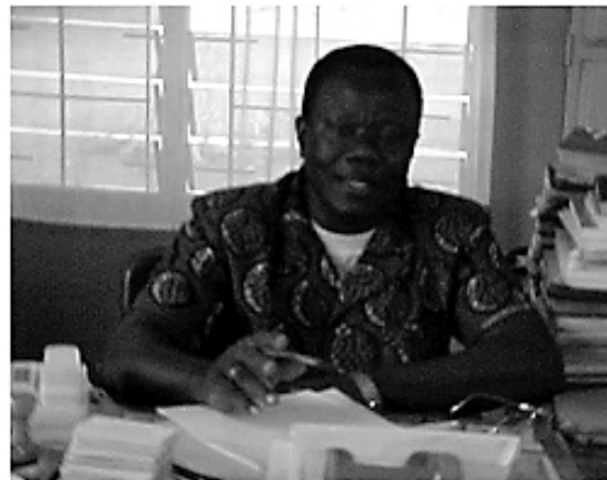
Sous-Préfet of Bembéréké