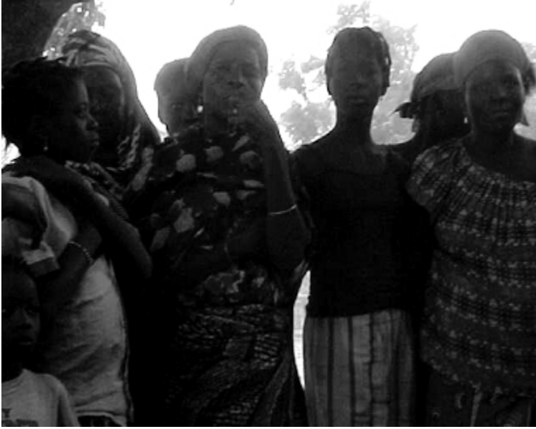
Banikoara, Gomarou: Neighborhood women attending a PCHC meeting

Except for Beroubouay, where GESCOME II seems to have been virtually the only environmental health actor, it is impossible to trace all of the rapid changes in practices to GESCOME. However, the evidence is suggestive of a large or