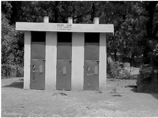
Sinendé, Danrigourou quartier: A GESCOME II latrine

observed every day of the two-month period. There were at least two weeks when they were not observed at all. The preliminary results are attached (see Annex C). The most important results were: