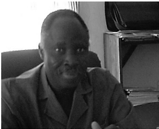
Sous-Préfet of Banikoara

Sous-préfets: The presence of sous-préfets or their representatives on the CDSE and EME ensured that the local administration would be informed and have a voice in decision making. Their participation gave sous-prefets a stake in the project and contributed to their strong support of GESCOME activities in the Banikoara, Sinendé and Bembéréké communes. It put environmental health “on the map” for sous-prefecture governments.