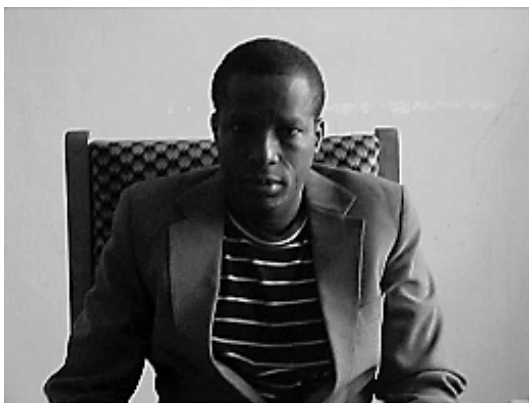
Sous-Préfet of Sinendé

Mayors and chefs de quartier: The inclusion of these elected local government officials brought them into the project as partners and mobilized them to participate in organizing quartier level town meetings. During the town meetings, the community conducted a participatory rapid appraisal (PRA), discussed health