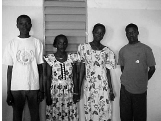
Banikoara, Demanou quartier: Two latrine monitoring teams

While Parakou was included in the CDSE in GESCOME II, there had not been any GESCOME II follow up in the city since December 2000.