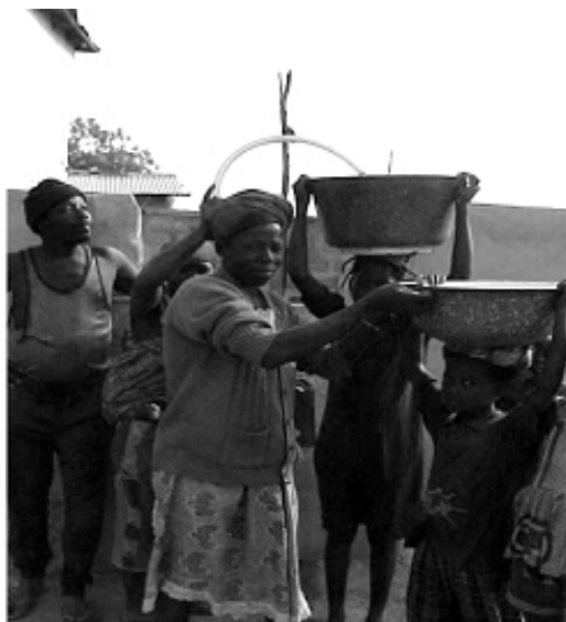
Community women adapt a water resource point: At a Banikoara water resource point, neighborhood women attached a long wide hose to the faucet and planted a tall, thick forked stick in the ground nearby. With the help of another woman who points the hose into the user's water container, a woman can keep her water basin on her head while filling it from the hose, which is just the right height and angle to run water into her basin. This saves the woman from bending and lifting a full heavy water container onto her head. The hose rests in the fork of the stick when not in use to stay clean.

All GESCOME I latrines in Parakou are pay per use. The three latrines that the team visited were very busy. For example, the team observed five users during a 17-minute period in the middle of the day (which latrine monitoring data from other towns showed is one of the least busy periods). That latrine reportedly earns from 30,000 to 40,000 CFA per month, and the custodian reports to the still-active CGMP.