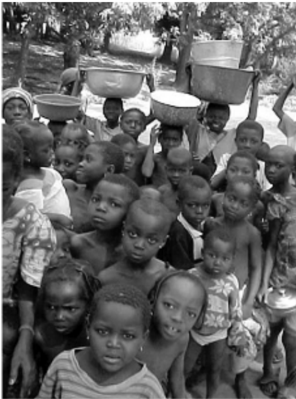
Bembéréké children and friends collecting water from GESCOME I water source.

The lesson learned from the team process of conducting this lessons learned exercise mirrors this lesson of GESCOME. The perspectives and skills of professionals from different sectors were crucial in understanding the project. This combined multi-sectoral understanding provided breadth and depth to the report, as well as to the understanding of each team member.