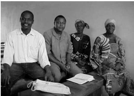
Several Bembéréké EME members

Community representatives: At the commune level, elected representatives of neighborhoods participating in GESCOMME sat on the EME. Neighborhood representatives generally reflected their community's socio-economic structure. Although they were elected in open town meetings, EME community representatives and CGMP members often were recruited by the mayor and chefs de quartier. Half of the community representatives were women, and in most EMEs, one of the women chosen as a community representative was a leader of a local women's group (groupement des femmes).