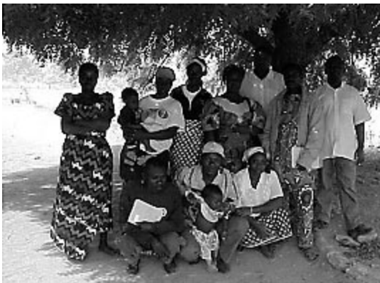
The Sinendé EME

The Quartier Environmental Health Committee is a structure that GESCOME II added to assist the EME with its community organizing functions. The community