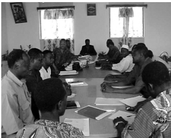
Parakou: CDSE Round Table—the préfet is seated at the head of the table near the windows.

EME coordinators represented EMEs on the CDSE as advocates and spokespersons and served as the main channel for conveying community sentiments to departmental authorities. Conversely, the coordinators informed their local communities about CDSE policies and decisions taken during Round Tables. All three EME coordinators worked for the government.