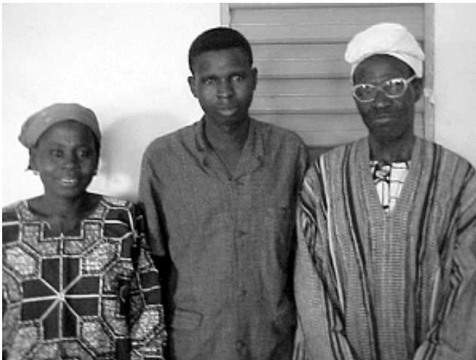
Banikoara, Orou Gnourou quartier: Latrine CGMP

The local community also decided on the water users and latrine committee membership (the latrine committee is a Banikoaran community invention and only Banikoara neighborhoods chose latrine committees). The community and CGMPs made all decisions about the location of infrastructure, resource mobilization and management to finance and maintain infrastructure, setting user fees and dues, and custodian recruitment, monitoring and payment.