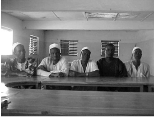
Chefs de Quartier, Banikoara

Rural development agents: Those on the EMEs actively participated in and supported GESCOMME activities. This was particularly true in Banikoara and Sinendé communes, where the EMEs chose the rural development department representative to serve as the coordinator. They did not participate as actively in the Bembéréké commune.