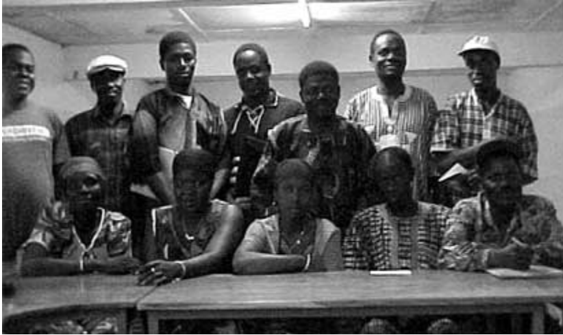
The Banikoara EME

When GESCOMÉ wanted to work in a new quartier, it first approached chefs de quartier (local elected leaders at the neighborhood level). GESCOMÉ solicited their interest and, if they agreed, their help in organizing a community meeting to explain GESCOMÉ to the quartier residents and explore whether the community wanted to participate in the activity.