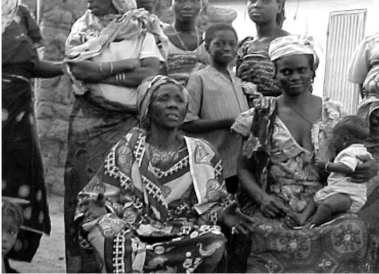
Sinendé, Lemanou neighborhood: A community woman speaks her mind during a PCHC meeting.

Bembéréké had relatively few other environmental health activities. The Evangelical Hospital conducted intensive hygiene promotion together with promotion of household latrines, particularly in one GESCOME I neighborhood. In this neighborhood, compounds close to the GESCOME I latrine had adopted its use. Compounds farther away had built household latrines.