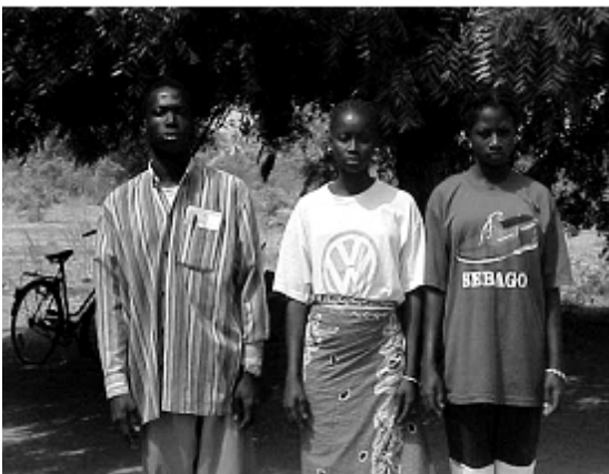
Bembéréké latrine monitors: The monitor on the left is from the Demanou quartier, and the two on the right are from the other quartiers.