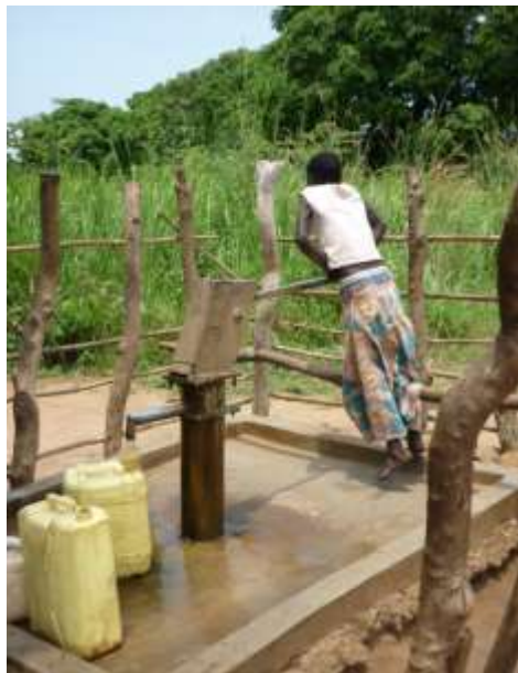
Figure 6; Functional Borehole in Dzaipi sub county, Adjumani district

There is substantial evidence that these associations strengthen accountability mechanisms. The water users in Kibaale can hold the association accountable for work carried out by hand pump mechanics in the district, with the radio announcements and a mobile unit. In all the districts evidence has been found on an increased demand for accountability from the district towards these hand pump mechanics. The districts mention that if the association is able to deliver, they will be supported.