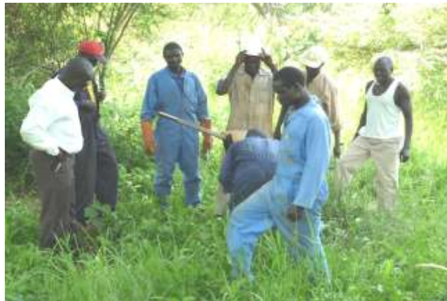
Figure 5; DWO and Hand pump mechanics working together

There is sufficient evidence that district water offices are now working more closely with the pump mechanics because of this association. During the first general meeting of hand pump mechanics in Yumbe the secretary works urged the hand pump mechanics to register so they receive government contracts. The district water office of Yumbe has planned and budgeted for the rehabilitation of 50 boreholes in collaboration with the association. During the last follow up visit, the District Water Office was using the association to conduct an in-depth assessment of all the non-functional water sources. This trend has also been observed in Adjumani, Kejyojo and Kasese. In Kasese, the district has outsourced the rehabilitation of 12 boreholes to the association.