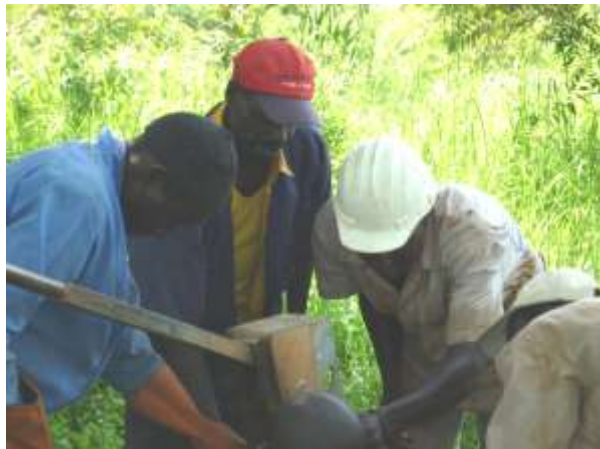
Figure 4; Hand Pump Mechanics working together in Yumbe district

Increased learning and working together seems to be the first result obtained of having a district-based association. As several organisations (government and NGOs) train hand mechanics at different times and locations, they are not aware of each others' existence. There have been several cases reported of the hand mechanics increasing working together on complex repairs after getting to know each other through association. As these complex repairs require two or more hand mechanics, collaboration is a key improvement in service delivery.