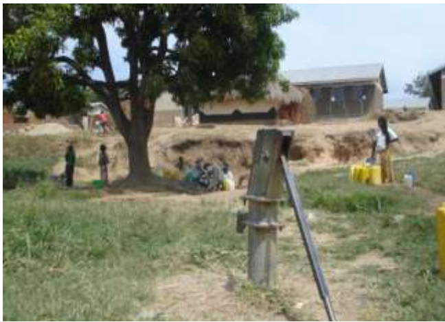
Figure 2; Non-functional water sources, reducing safe water coverage

An assessment to improve management structures in water supply by Youth Development Organisation (YODEO) on behalf of SNV in Adjumani district late 2007, revealed a functionality rate of 67% of the boreholes. This figure is much lower than the 90% functionality reported by the ministry in 2007. The report identified several causes of this low functionality. Some of these were related to the physical maintenance of boreholes such as: the lack of spare parts, inadequate repairs, high prices of repairs and difficulty to access a trained technician. Furthermore, the assessment identified that the hand pump mechanics in Adjumani didn't have a legal identity to represent them at the