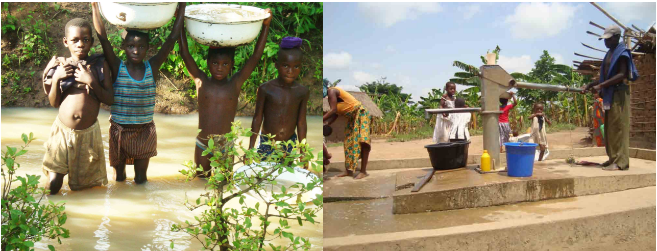
Plate 1: Informal and formal rural water sources