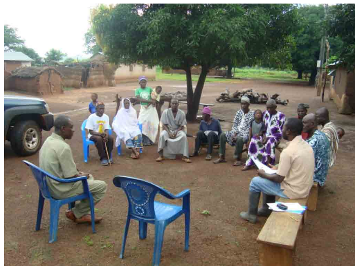
Plate 3: A typical focus group discussion with a WATSAN committee (rural)