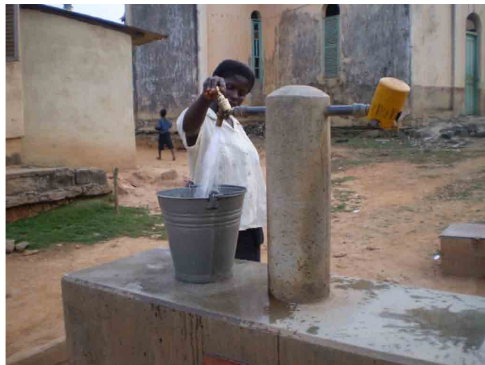
Plate 2: A public standpipe of a small town water supply scheme