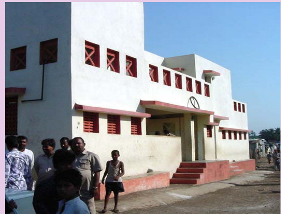
Community toilet blocks in Shyam Nagar, Andheri (E) and Prem Nargar, Goregaon