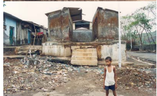
A familiar feature in the slums of Mumbai: the public toilet block