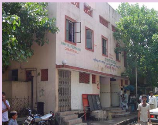
Community toilet blocks: children toilets (top) and extra features, like community hall (bottom)