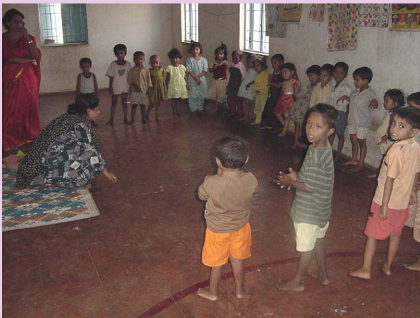
Class-room for pre-school children built above the toilet block

In particular, the average monthly expenditures are reported to be Rs. 16,000 (US$330). The composition of expenditure is: water - 47%, staff salaries - 30%, electricity - 9%, consumables - 5%, repairs - 6% and office maintenance - 3%. The financial self-sufficiency of the CBO is further reflected by the fact that its management committee invested Rs.32,000 (US$660) in a bank term deposit and another Rs.65,000 (US$1350) in a saving bank account. From this year onwards, the CBO has also taken up the responsibility to run the children's pre-school (initially run by an NGO). The level of transparency is also very high, as the CBO recently submitted its annual statement of accounts to the Registrar of Charity Commissioner