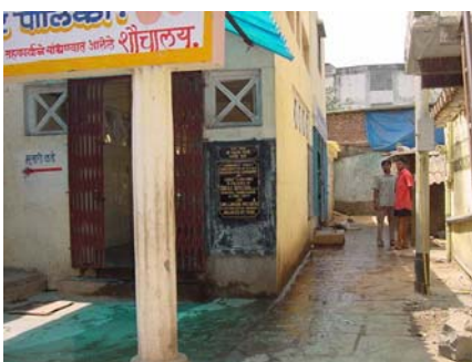
The changing face of slum sanitation in Mumbai