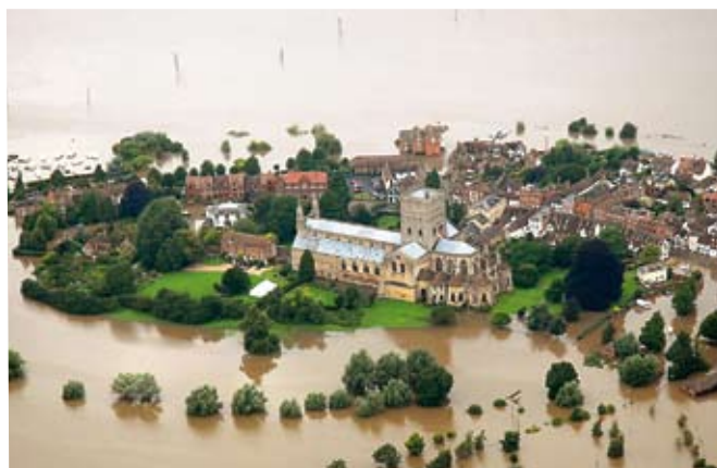
Tewkesbury Abbey is surrounded by floodwater from the River Severn and River Avon, western England, 23 July 2007. The flooding crisis in central and western England continues with thousands of homes losing water and electricity supplies. The Environment Agency said water levels in the county surpassed the devastating floods of 1947.