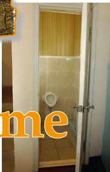
The new indoor toilet was inaugurated in September 2006.