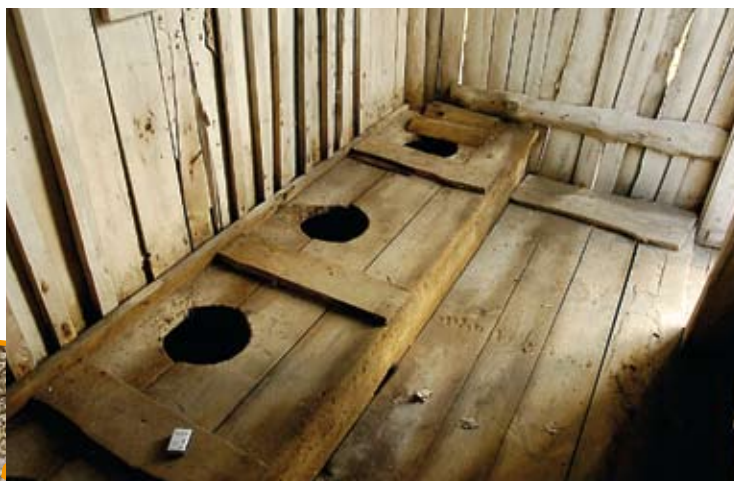
The old outdoor toilet in Bobryk village school.