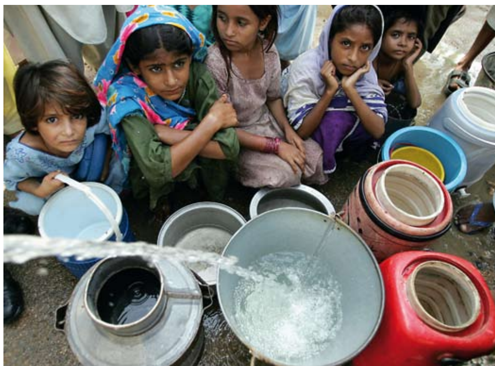
Pakistani children wait to fill their pots with fresh water in Karachi September 20, 2005. Water supplies contaminated with sewage and toxic waste killed at least eight people and led to around 3,500 more being treated in hospital in the Pakistani city.