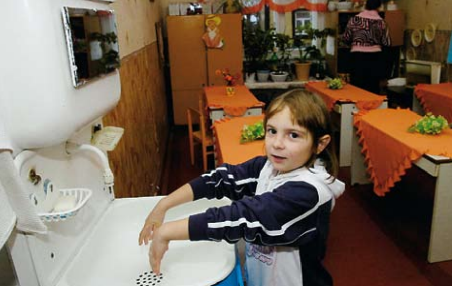
At Vertiiivka kindergarten, the pupils know it’s important to wash their hands.