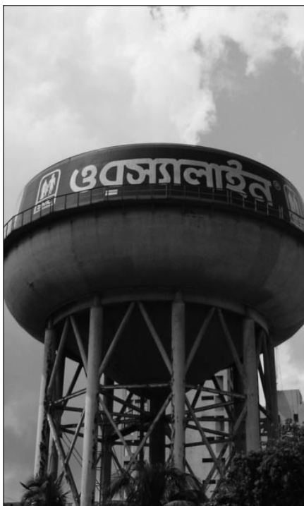
Water stored in disintegrating water towers like this pose a serious health risk to those using it.

Many different agencies have well-established water-quality surveillance programmes, but to date they have not been brought under a single