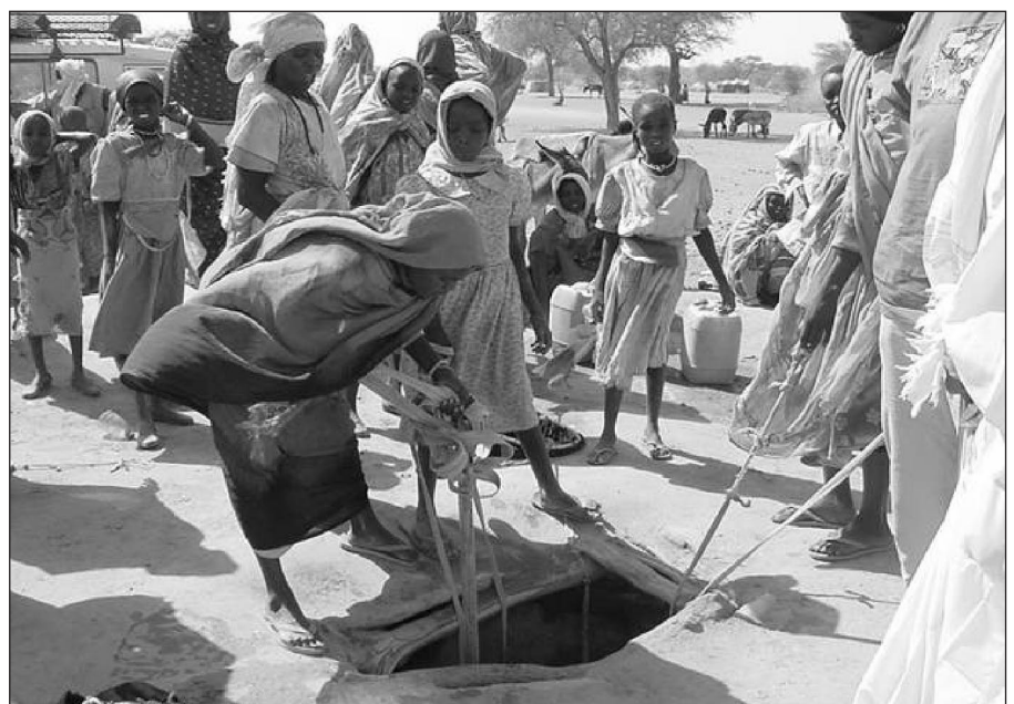
Women and children bear the brunt of the water collection activities. These refugees from Darfur are staying at Bahai spontaneous settlement, Chad