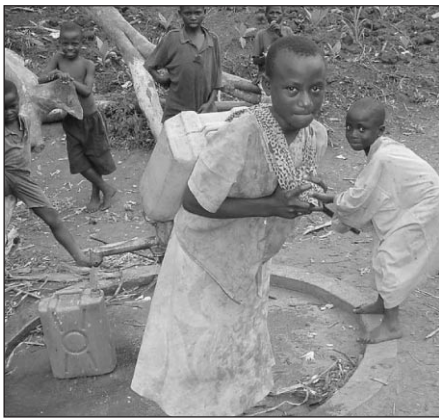
People need to feel safe when they collect water – children at Kyangwali camp, Uganda