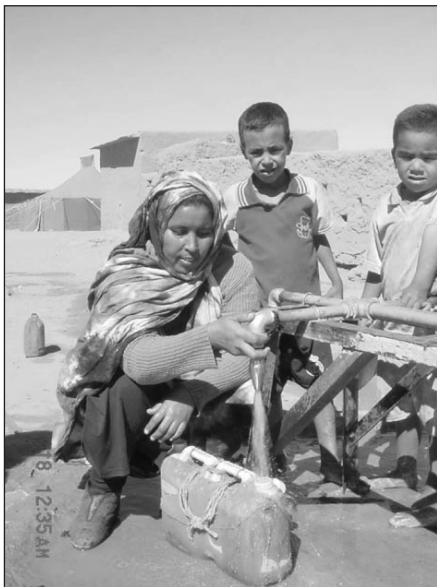
80% of all refugees are women and children – this camp was in Eyone, Algeria.

used unsafe water sources and that there was a high prevalence of malnourished children with reported diarrhoeal diseases. 3 An MSF report from northern Uganda painted an even grimmer picture: people had to queue for three hours a day for water with an average availability of less than 3 litres per person per day. Those searching for water outside the camps risked being attacked by LRA (Lord's Resistance Army) fighters and so were compelled to gather contaminated water from unhygienic sources. 4 Inequalities in water distribution across Kakuma camp (Northern Kenya) were a direct factor in a cholera outbreak there (see Figure 1). 5