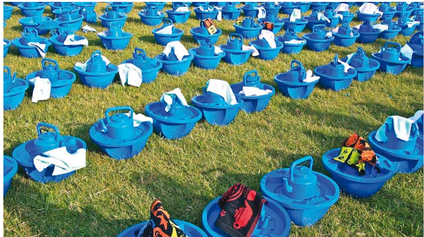
Handwashing stations at Modibo Keita Sports Stadium, Mali