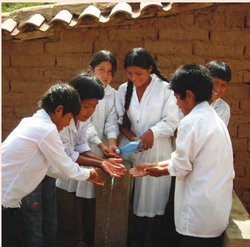
Children practise handwashing together

Bolivia took handwashing with soap to the people during GHD celebrations, using street fairs, dramas, festivals and marches – even a soccer game between Bolivia and Brazil – to raise awareness of handwashing with soap. Street fairs and dramas highlighted that handwashing was not only an individual behaviour but had an element of social responsibility as well. This message became all the more critical when public concern about the H1N1 (swine flu) disease propelled GHD's significance and momentum. Heightened risk perception is claimed to be a motivator for health behaviour change as is the idea of 'affiliation' – doing what is considered to be the right thing. The combination of both in Bolivia's handwashing with soap campaigns seemed a driving factor in moving people to properly wash their hands and to make sure their neighbours did as well. Anecdotal evidence from Bolivia suggests that diarrhoeal rates dropped as an additional benefit during the H1N1 season due to increased handwashing with soap.