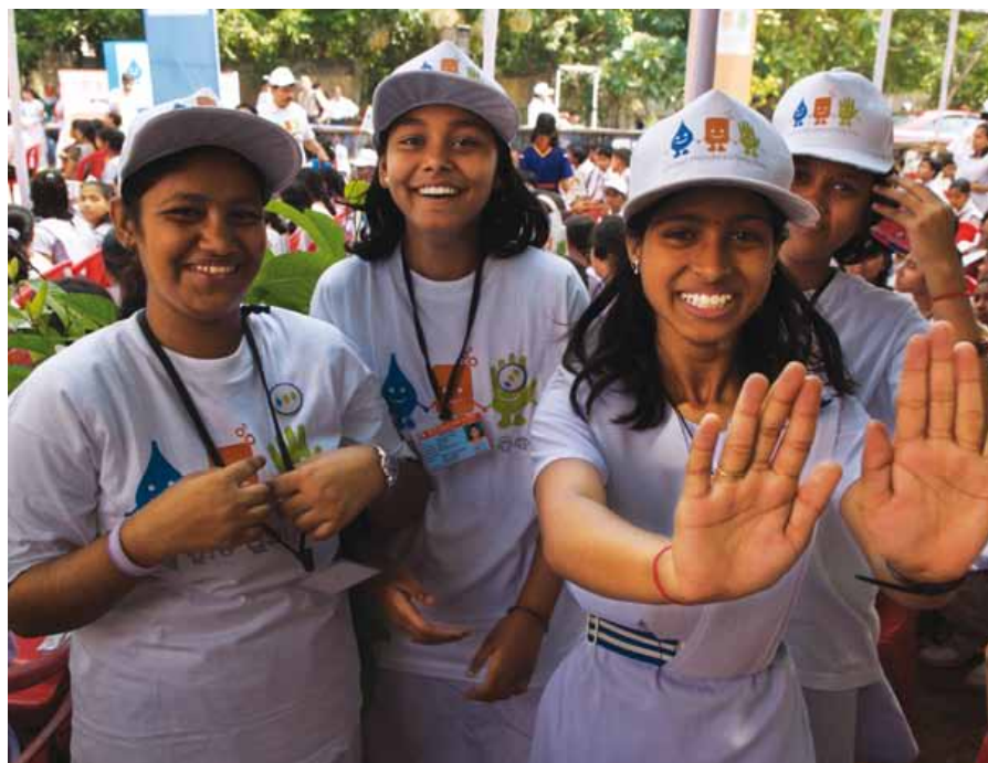
Children participate in Global Handwashing Day activities in India

support improved handwashing communications and programming nationally. In particular, insights from countries are presented and discussed in light of the potential roles of partnership in bringing handwashing with soap into the mainstream. The insights and stories presented are based on UNICEF programming experiences.