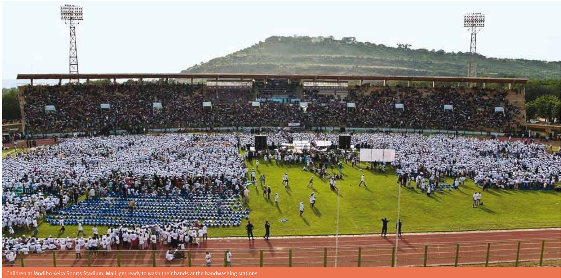
Children at Modibo Keita Sports Stadium, Mali, get ready to wash their hands at the handwashing stations

UNICEF has a rich history of partnership in public health sectors such as immunisation, HIV/AIDS and WASH to increase impact and reach of activities. Global Handwashing Day has provided yet another platform on which to develop joint campaigns with messages which can then be implemented by various partners. As in other sectors, partnership with the private sector is not new territory. What perhaps distinguishes GHD are the wide-