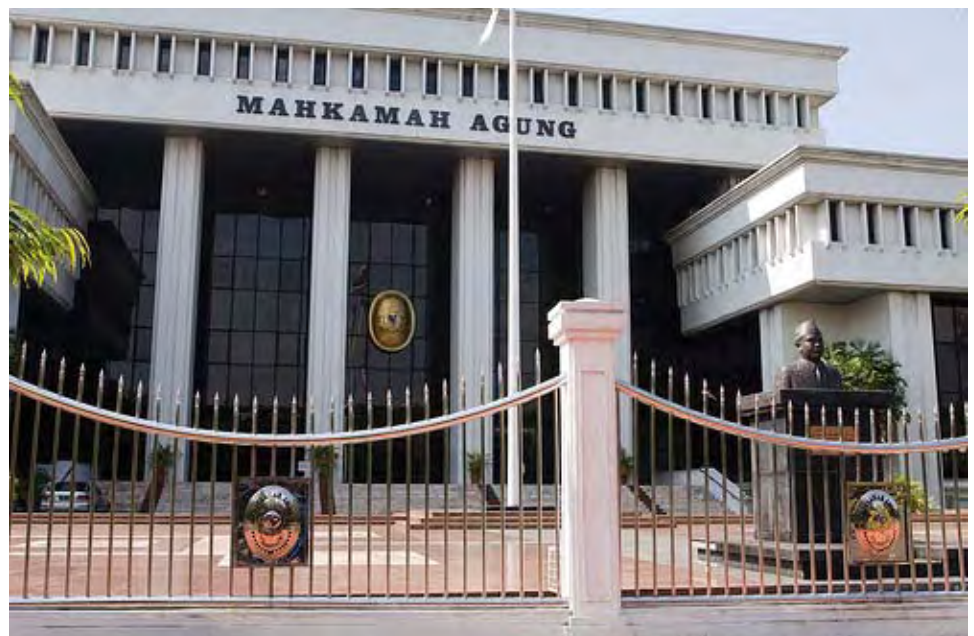
USAID supports sustained Justice Sector reforms.

will strengthen the capacity of the media, NGO and citizens "watchdog" groups, and religious and educational organizations, which also have important roles to play in strengthening accountability at the national and regional levels.