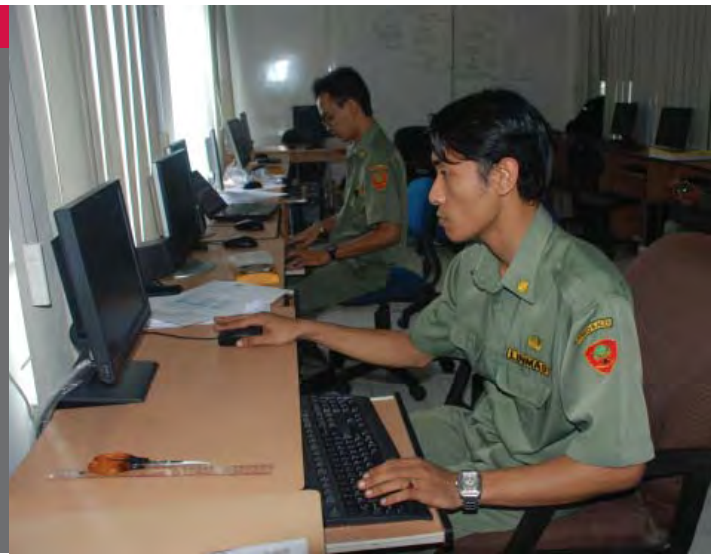
LGSP / HARUM SEKARTAJI

Computerization of government offices increases transparency and accountability.