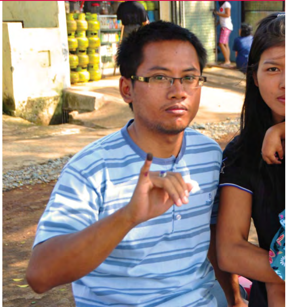
USAID supports strengthened democratic governance in Indonesia.

Second, the range of accountability mechanisms needs broadening and strengthening. Indonesia has a long history of powerful elites – including politicians, businessmen, senior government officials and military officers – rarely being held accountable for corruption and other abuses of power. Some of the excesses have been reigned in over the last decade with the strengthening of a variety of