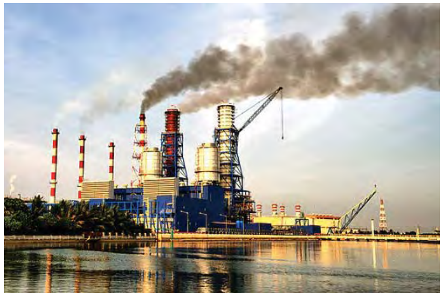
Indonesia ranks third globally in carbon emissions.

USAID support for clean energy development in Indonesia will yield significant results with a modest investment. USAID will carry out a selected array of activities that are economically viable and could quickly lead to private sector driven replication in order to increase the amount of clean energy generated. To achieve this objective, USAID will support local institutions engaging in public information campaigns and analysis for electricity tariff reforms to reduce the heavy claim on the national budget (25% in 2008).