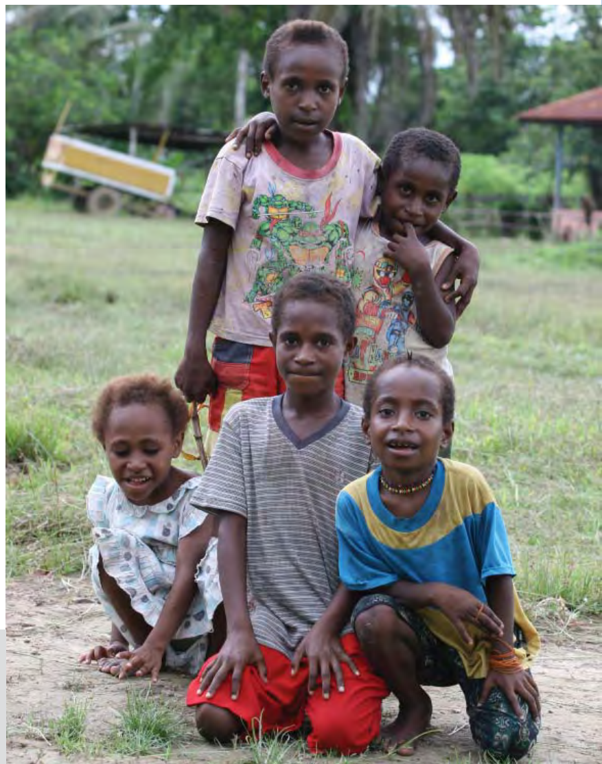
RIGHT: USAID is working to mitigate global threats and secure a prosperous future for all Indonesians.

A growing global economic crisis will challenge not just the country's economy, but also its social harmony, its government, and the skills and priorities of its political leadership. With a slowdown in macro-economic growth likely in 2009-2010, it becomes even more important that Indonesia's national and local governments be able to deliver basic social services, stimulate investment, control corruption, and preserve social harmony. The strategy assumes that the economic downturn for Indonesia will be over by 2011. Other needs, currently unforeseen, are certain to emerge during the strategy period; USAID will retain flexibility in its budget to encourage innovation and to respond to new problems. Resources will be reserved for long-term training in the United States for Indonesia's next generation of problem-solvers,