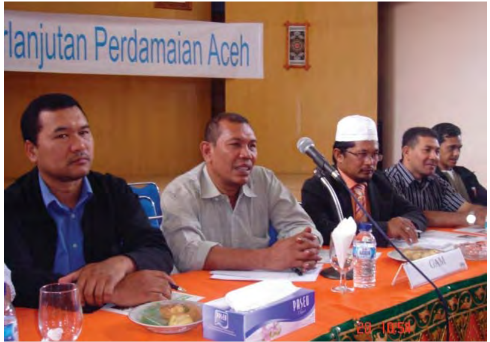
USAID continues to promote peace building in Aceh Province.

The Rule of Law program seeks to bolster the capacity of state and non-state partners to prevent, expose and punish corruption and other abuses of power. In the areas of Indonesia where peace building activities will be implemented (Aceh, Sulawesi and possibly Maluku and Papua) corruption