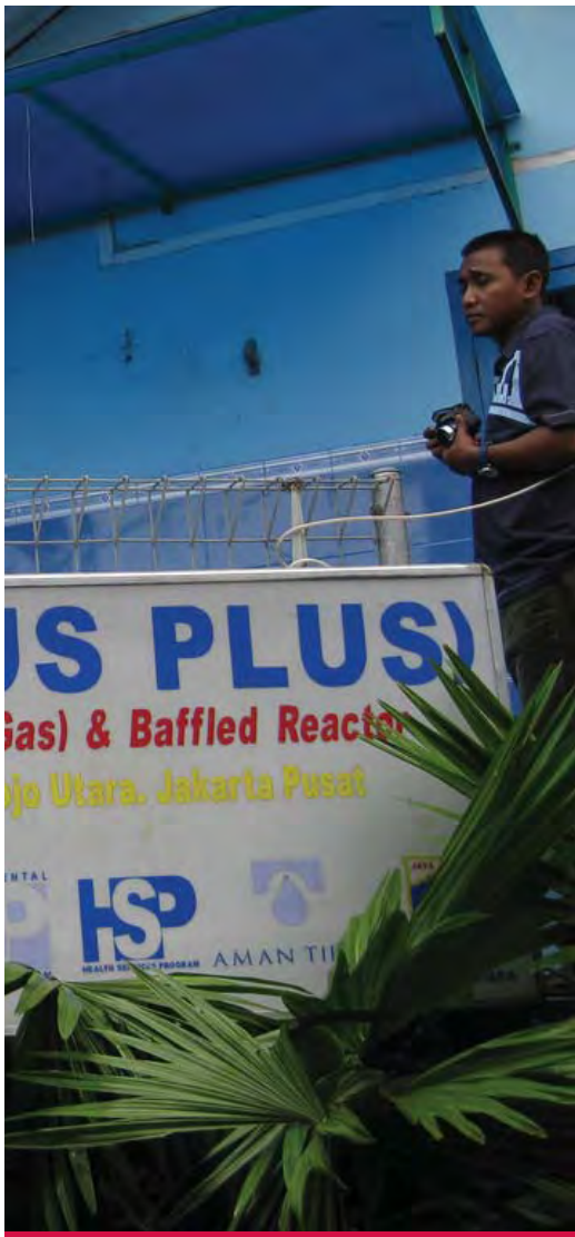
USAID / YUSAK OPPUSUNGGU