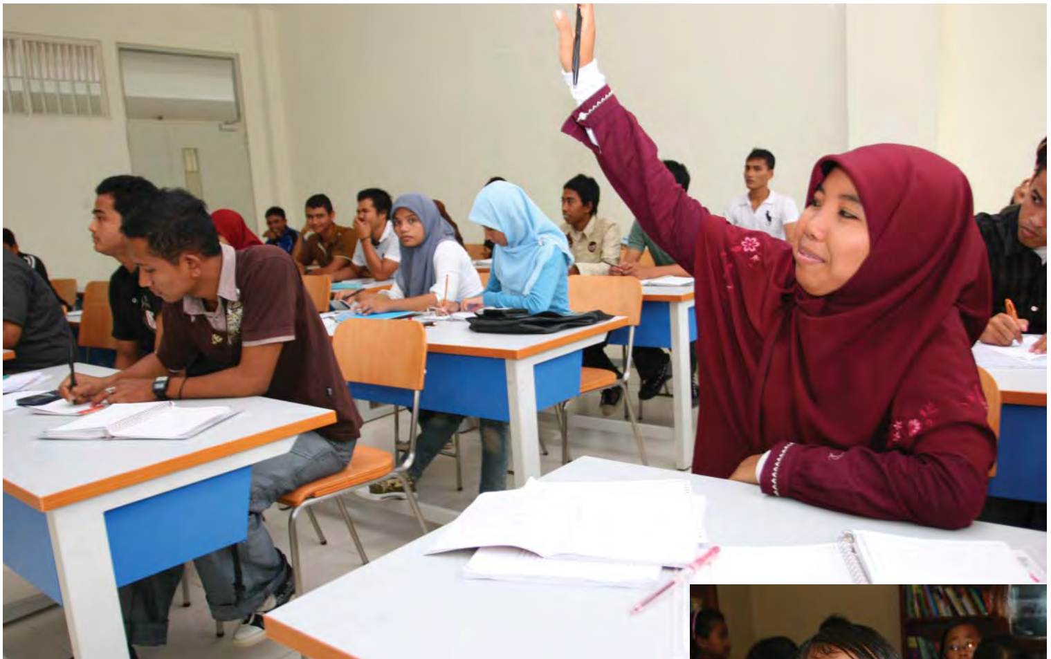
USAID supports interactive classrooms for effective learning.