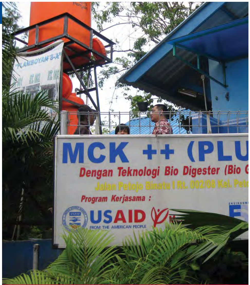
Improved mother and child health is a central USAID objective.

USAID is building on the successes of past and existing partnerships. USAID's goal is two-fold: 1.) to partner with an effective and manageable number of private sector firms and non-traditional partners to leverage additional resources to address key development challenges, and 2.) to affiliate U.S. universities with Indonesian "institutions of excellence" for education and research.