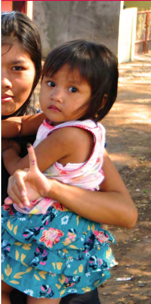
USAID / RUICI TIO

Computerization of government offices increases transparency and accountability.