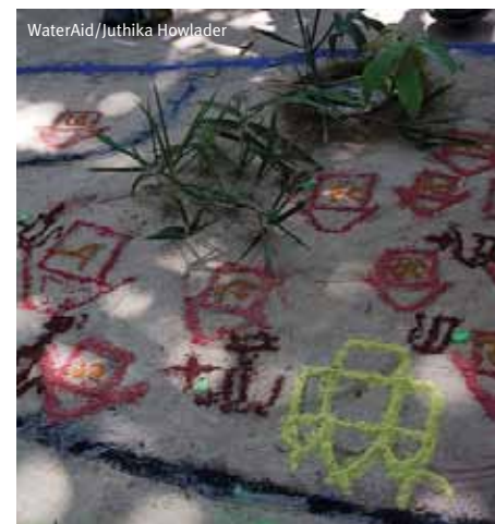
A village community map.