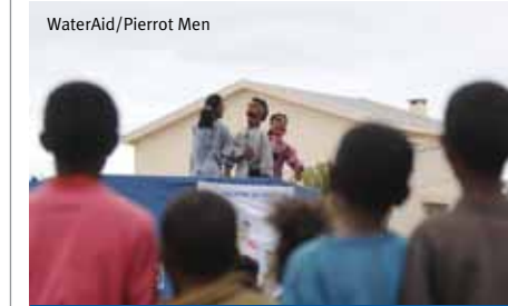
Children in Madagascar watch a hygiene promotion puppet show.

Children are taught good hygiene messages in schools through songs, games and drama. This is done because children are more open to discussing and changing hygiene habits than adults. When children learn the importance of good hygiene they are encouraged to pass these on to their families and friends, extending the benefits long into the future.