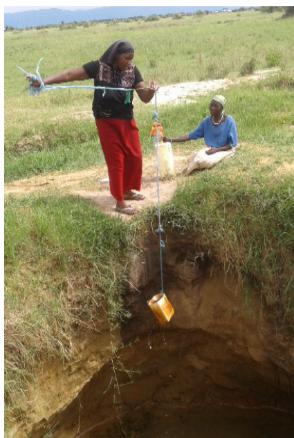
FIGURE 2: A woman in Rwangara draws water from an unprotected open hand dug well after paying $0.14

Access to safe water for drinking and domestic use is a tall order for the residents in Rwangara Parish. The majority of households have no other option than fetch water from unprotected open wells, which due to the unstable ground conditions are prone to frequent collapsing and even drying up. The quality of the water from these unprotected wells is poor, not only because of high salinity levels, but also because of potential risk of contamination from faeces from cattle and humans. It should be noted that many of these open wells are not communal but privately owned. As such, the households without access to wells are charged for poor quality water, which is potentially life threatening. In fact, when compared to communities in areas supplied by the National Water and Sewerage Corporation, there are large disparities in water tariffs, the quality and accessibility. The water mapping exercise conducted by HEWASA in Ntoroko District revealed