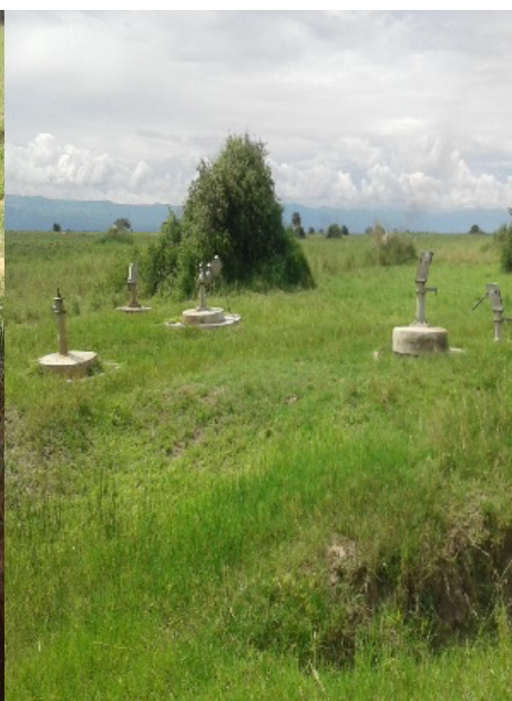
FIGURE 3: Some of the nonfunctional boreholes where pipes have eroded due to the saline water in Rwangara, Kanara Sub County.