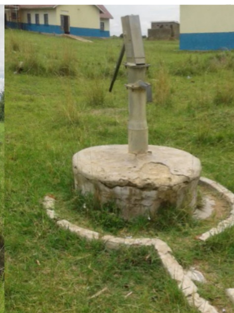
FIGURE 4: The high salinity levels in the water have also rendered the borehole at the Rwangara Health Centre II dysfunctional.

Photo by: Birungi Stephen, HEWASA (Mar 2018)