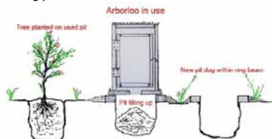
Fig. Schematic illustration of Arborloo and its use