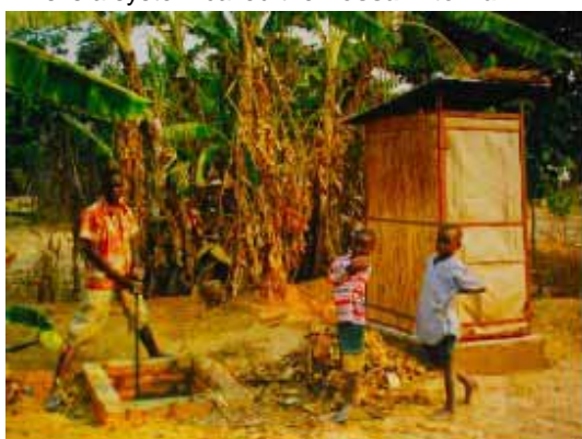
Figure. Fossa Alterna

If there is limited space on the compound or moving latrines is not preferred then it is possible to make two permanently sited pits and alternate between them at yearly intervals. The fertile compost can be dug out and used on the garden once a year. This is a system called the Fossa Alterna .