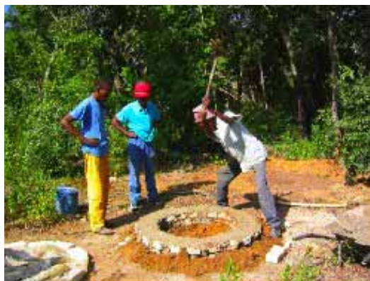
Figure. Digging inside the built beam or collar.

To start all that is required is part of a bag of cement, and some good river sand and thick wire. With this the householder can build a concrete slab, which will last for many years (actually a life time). The slab is mounted on a “ring beam” of bricks or concrete and a shallow pit is dug down inside the beam. A simple structure for privacy, made from locally available materials, is then built around the slab.