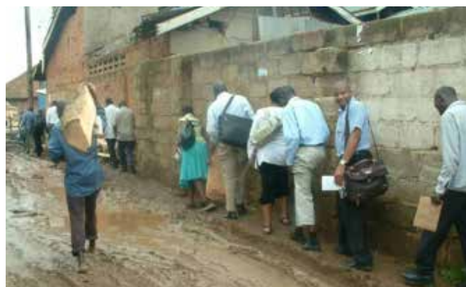
Learning journey sanitation marketing in Uganda

In 2011 and 2012, RCN coordinators and IRC staff collected evidence of sector learning and change. These stories of change were categorised based on an adaptation of the Reflexive Monitoring in Action “Learning Effect Framework” (table 2). In distinguishing who learns (e.g., person, organisation, network, sector) and what changes (e.g., knowledge, insights, policies, practices, institutions), the framework has helped illustrate the range of changes occurring—from individuals acquiring new insights or knowledge to institutional changes and new approaches that have become institutionalised across the sector.