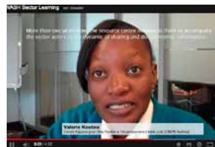
Video documentation of sector learning (YouTube)

Making lessons and information flow from the national level to sub-national levels. RCN documentation of good practices and lessons learnt were shared in physical platforms (events, meetings, training, resource centre libraries) and virtual platforms (websites, polls, email groups). Learning and sharing was facilitated through exchange visits, inter-district learning events and the establishment of sub-national resource centres. Interviews about sector learning—captured on video—were also made available on YouTube .