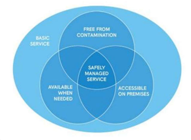
Figure 1 Three criteria must be met for a basic service to be classified as a safely managed household service, according to the JMP (WHO & UNICEF, 2017).

Basic water service provision is a critical first step on the way toward safely managed services and is a means to realising the human right to water but must not be an end in itself.