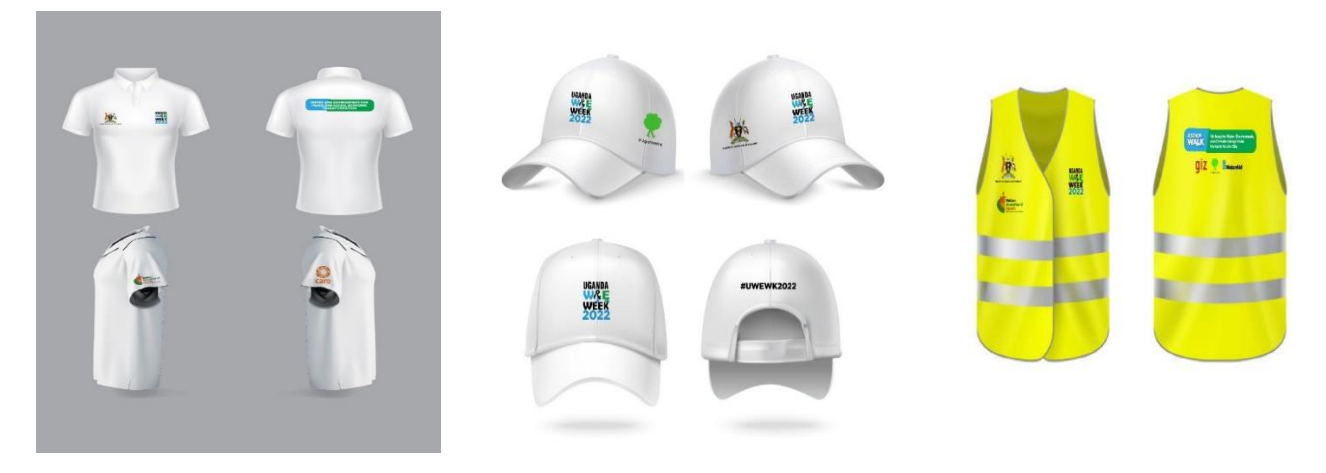
Figure 27: Some of the branded publicity materials shared with communities/stakeholders during the UWEWK2022

These objectives were achieved through use of several communication and publicity channels that included: radio spots and mentions, television spots, talk shows and engagement, print media, social media campaign, mwe magazine, daily water fronts, dissemination of publicity materials (branded bags, pens, notebooks, t-shirts, key holders, flash discs, banner etc.), endorsements, UWEWK documentaries among others.