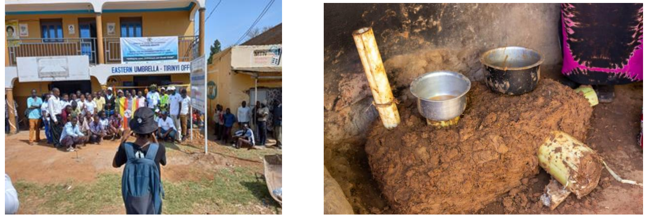
Figure 6: Some of the UWEWK2022 activities held in Eastern Region in pictures