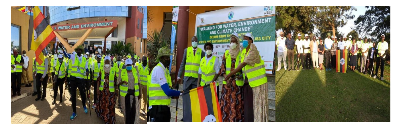
Figure 10: Flagging off Walkers at MWE headquarters by Hon. Aisha Ssekindi, Minister of State for Water, Owek. Mariam Nkalubo Mayanja, Minister of Lands, Agriculture, Environment and Bulungibwansi, Buganda Kingdom and in Mukono by Hon. Gganzi Stephen

In collaboration with MWE, the following partners and sponsors supported the 450 km walk: Agroforestry, National Forestry Authority, Care International, and , Bio vision Africa, NWSC, Total Energies, DFCU, Pearl Dairy Farms Limited, Buganda Kingdom, Church of Uganda, Globe Nature Consults, Busoga Kingdom, UBC, NBS, Bukedde, New Vision, Roofings Limited, UMA and WWF.