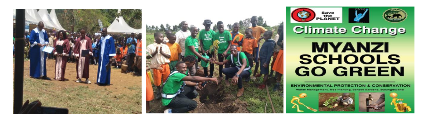
Figure 5: Buganda Kingdom community leaders engage in activities that address climate change as one of pre-event of UWEWK2022

The Central regional activities included the following stakeholders; MWE regional structures, Kassanda District (political and technical staff, Buganda Kingdom team from Busiro, Gomba, Buwekula and Ssingo Counties, Kassanda South Area MP, NGOs namely Transparency International Uganda, UWASNET, Joint Christian Council grassroot teams, Busiro Youth, Wells of Life, Water Campass, ROOTs Campaign Team, Mityana – Mubende Media Association, Uganda Prisons Service – Myanzi, ICEA Group, Myanzi Schools Go Green, Ndugu Youth Empowerment Group, Blue Conserv Africa with Save the Planet grassroot campaign team, Radio Mboona FM, Nkobazambogo Youth, Tree Adoption Uganda and Smart Cities Advocacy Group.