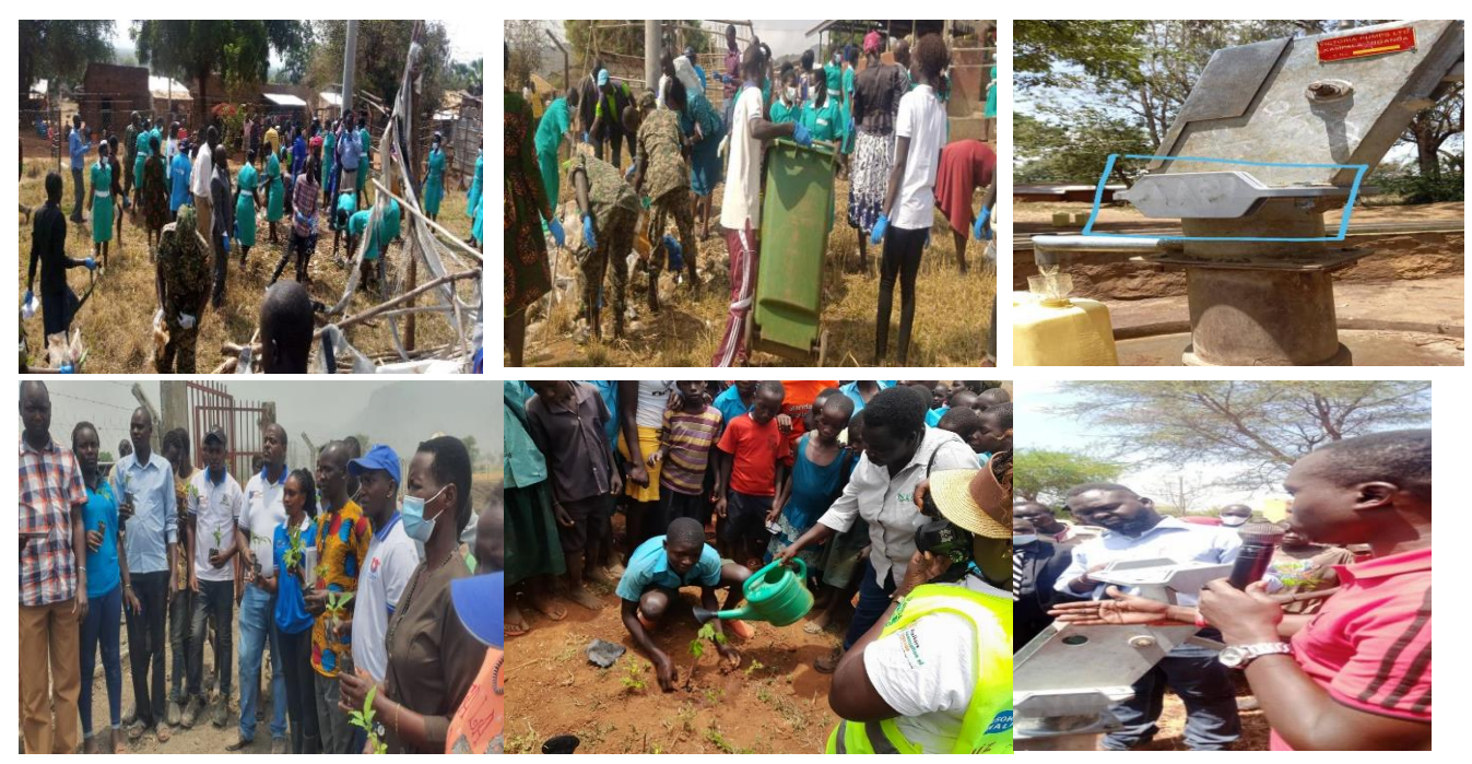
Figure 2: Activities carried out in Karamoja region to mark UWEWK2022 in pictures

Exhibition and parade/matching in Lobalangit, Karenga solicited the participation of a cross section of stakeholders including UPDF, the nurses, schools, NGOs, government departments.