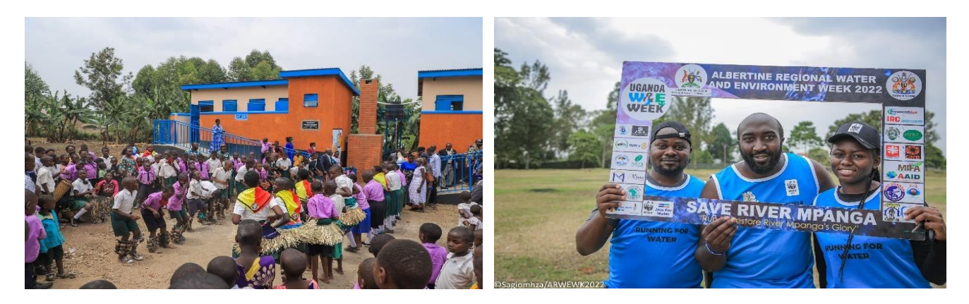
Figure 8: School children celebrating the commisioning of safely managed latrine at Buhara primary School and some of the runners in marathon