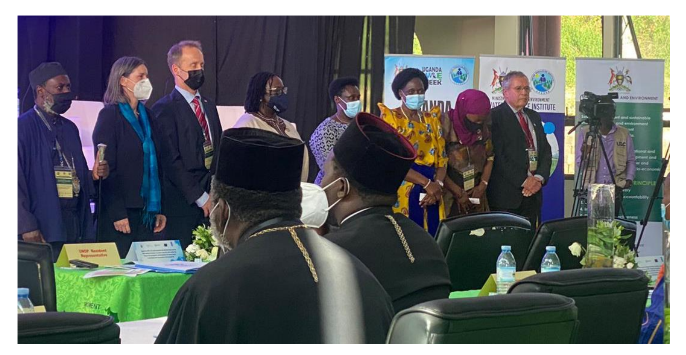
Figure 15: The guest of honour H.E Hon. Rtd. Major Jessica Alupo, with Hon. Beatrice Anywar, Minister of State for Environment with some of the guests representing different partners and stakeholders

The opening ceremony was held in the auditorium of the MWE Headquarters premises on Sunday March 20<sup>th</sup>, 2022 from 2:00 pm - 5:00 pm and was telecast live on both Uganda Broadcasting Corporation (UBC) and NBS television stations and live streamed to various social media platforms and zoom. The remarks by the Chairperson NOC Dr. Florence Grace Adongo' Director, DWRM- preceded a video clip highlighting the events of the previous UWEWKs and flowing into the overall theme of the 5<sup>th</sup> UWEWK2022. Several remarks were given by the different key participants these included the Deputy Ambassador of German His excellence Hans von Schroder; Ms Susan Ngongi Namondo- United Nations Resident Coordinator represented Ms Elsie G. Attafuah UNDP Resident Representative; the chairperson of Uganda Joint Christian council represented by Rev Constantine Mbonanbingi the Executive Secretary, UJCC. This was followed by opening remarks by Hon. Beatrice Anywar, Minister State for Environment- and the formal opening by the Guest of Honour, H.E Hon. Rtd. Major Jessica Alupo, the Vice President of Republic of Uganda, , who addressed the meeting.