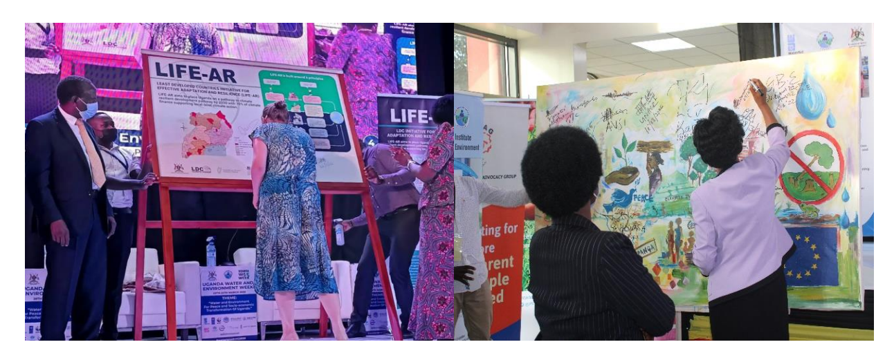
Figure 28: Several UWEWK2022 participants endorsing sector documents