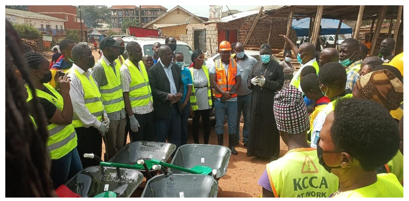
Figure 9: Nakawa Division local communities, religious leaders, KCCA staff and MWE staff in Kirombe Market one of the sites for the national cleaning up exercise