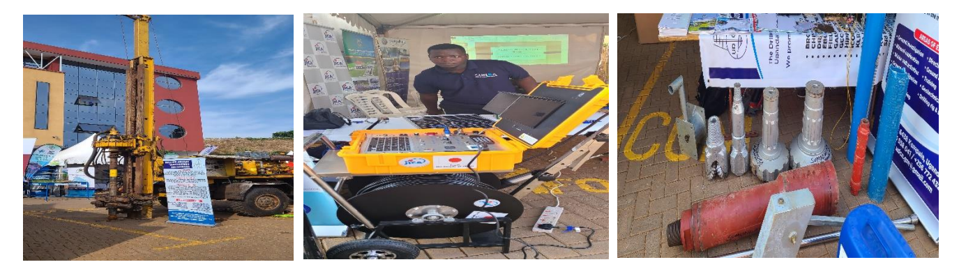
Figure 188: Plate showing some of the equipment and machines used in management and development of groundwater on display during the celebration to mark the WWD 22<sup>nd</sup> March 2022

This year the World Water Day focussed on groundwater. Groundwater is an important part of climate change adaptation process and is often a solution for people without access to safe water. Despite these impressive facts and figures, invisible groundwater is out of sight and out of mind for most people. It is against this highlight that the theme WWD 2022 was "groundwater: making invisible visible". In Uganda the WWD was marked as an event within the framework of the UWEWK by bring out and raising awareness on the technologies, equipment and the science of groundwater management and development.