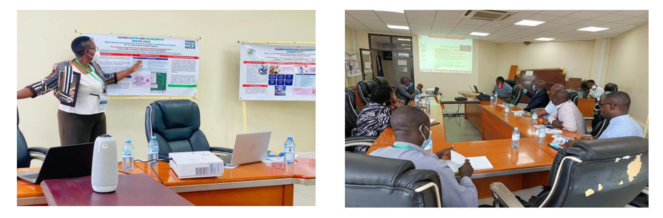
Figure 21: Plate showing a poster presentation and EURECCA side event

One of the nine parallel sessions in the mid-morning and afternoon (session 32 and 37) were paper and poster presentations on policy, practice & science in line with the day's sub-theme of Financing Water, Environment and Climate Change.