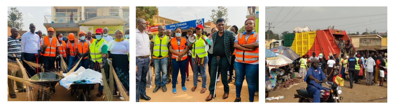
Figure 12: Plate showing cleaning and community mobilization exercise in Kitintale Market, Nakawa Division

NWSC in collaboration with MWE took the lead in the cleaning and raising awareness in management and development of water and environment resources with focus on sustainable water supply, sewerage management and pollution control in Kitintale area. And here the exercise was joined by the area MP, Hon. Balimumweso and Division Mayor.