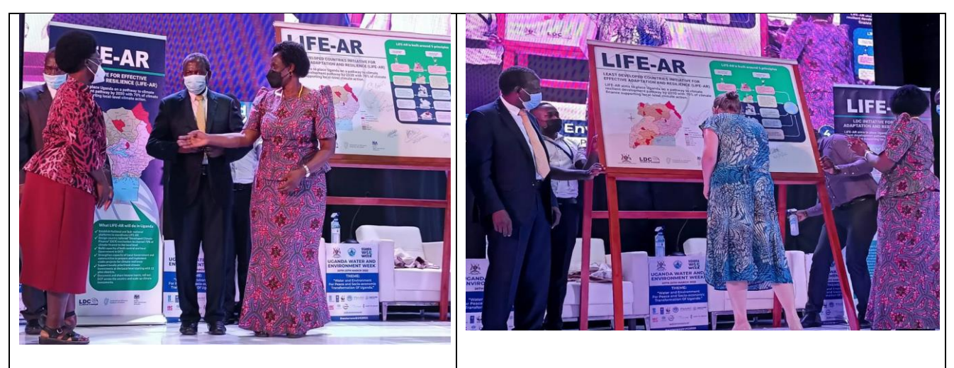
Figure 20: Hon. Matia Kasaija, Minister of Finance Planning and Economic Development officially launching the LIFE-AR project