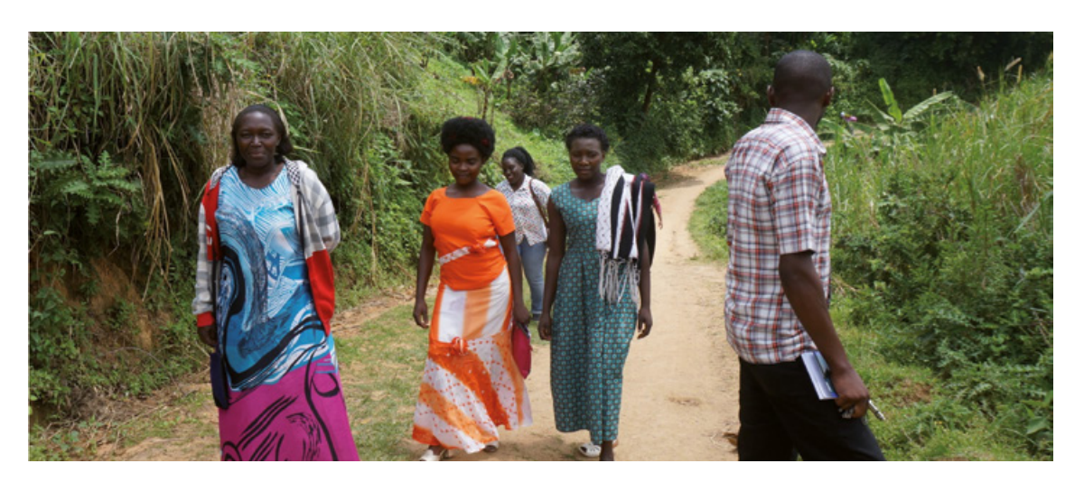
Women at the banks of River Mpanga, Fort Portal, during the 2018 Watershed Partnership meeting

The most notable exception to this is the International WP's engagement with capacity development partner African Civil Society Network on Water and Sanitation (ANEW), which has been largely unsuccessful owing to ANEW's internal governance issues. Consortium partners' L&A capacity was also strengthened in terms of using a more strategic, as opposed to opportunity-based, approach to L&A, expanding their networks, and their greater awareness of suitable L&A partners and targets.