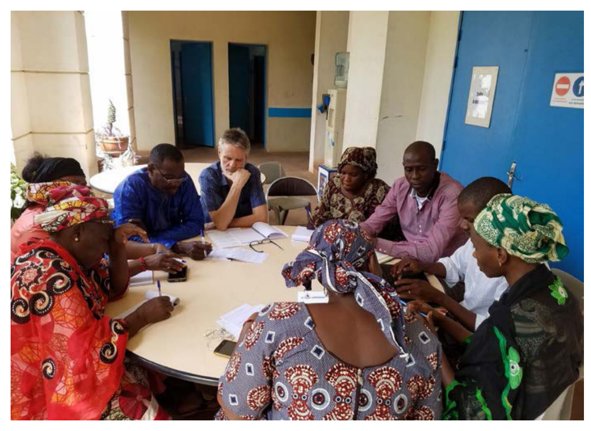
Watershed partners in Mali in discussion during accountability workshop, May 2018

Low engagement with some actors: Watershed's initial mandate prioritised governments, and identified religious leaders, the media, and the private sector as other significant actors in improving WASH governance. The lowest engagement was recorded with the private sector although it is one of the most important WASH actors with high leverage and connections with governments. In Kenya, contracted CSOs acknowledged that greater reach could have included groups working on agriculture, livestock, and public health in addition to private sector providers and the media. In Uganda, CSOs found that earlier engagement would have been beneficial with the private sector who has a large impact on WRM and environmental degradation, and with the media who would have supported advocacy interactions.