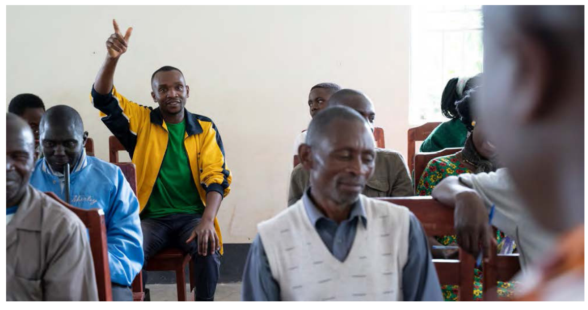
WP Uganda convening a policy influencing meeting with Team Leader of the Albert Water Management to discuss the Mpanga River in Mwenzori region.

More attention should have been given to context analyses and the convoluted policy-making context in Watershed countries: Four of the country WPs (India, Bangladesh, Mali & Kenya) mentioned initial difficulty navigating the competing legislation and mandates of different governmental bodies at national and local levels and the fragmentation of government departments. For example, in Kenya, CSOs reported difficulty navigating the competing mandates of the National and County Government under the new Water Act (2016), as it was difficult to determine which departments were responsible for monitoring WASH and WRM services. In Mali and India, the WPs highlighted initial difficulty in targeting the governmental actors involved in WASH & IWRM due to the large number, and fragmentation of, governmental departments. However, the WPs have gained a greater understanding of the policy-making context and navigated these challenges well and have thus been very successful at holding service providers to account, as evidenced by their harvested outcomes.