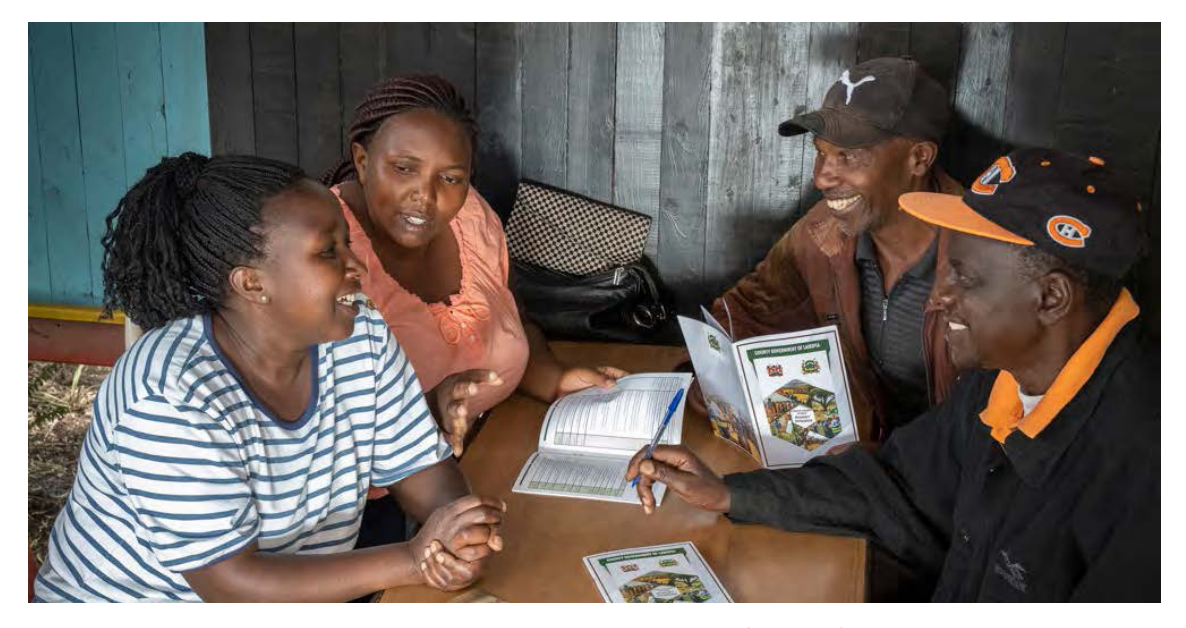
In Laikipia County, Kenya, the WP advocates for marginalised (pastoral) communities that are often deprived from water and excluded from decision-making processes.

Variation between technical and socially oriented implementing partners: Socially oriented CSOs tend to represent and include marginalised groups as part of their mandate and operations. Four of the six country WPs worked with village associations, women's groups and grassroots networks. The WPs that engaged with diverse and socially inclusive non-contracted partners seem to be those that have greater confidence in end-target groups being socially included. In the two WPs (Ghana, Uganda) that engaged with more 'technical' implementing partners (i.e. those that work in the WASH/WRM/environmental sector), there is less evidence of organisations' social inclusivity and subsequently, end-target groups' social inclusion.